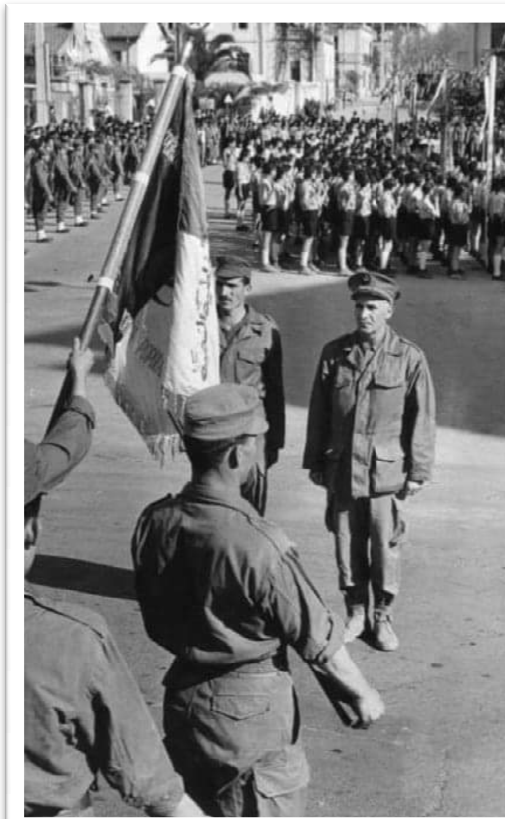
Yer tama tayfust, Aknanar Muḥend Welḥağ, ass n 5 di Yulyu 1962, di Sidi Freğ, mi yesuli senğaq n tmurt.