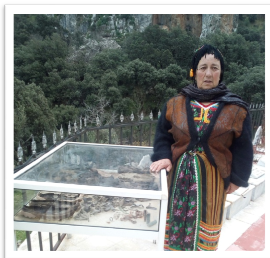
At Bekku Wezna, d yiwet gar yimesulya iy-id-yefkan isefra n tegrawla, ar tama-s kra n tyawsiwin n tegrawla, i yufan di tyiwant n Yillilten.