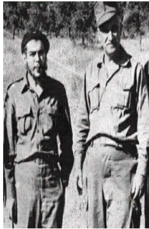
Yer tama tayfust, aknanar Muḥend Welḥağ Yer tama tazelmaṭ, Che Guevara, deg Iezzugen, aseggas 1963.