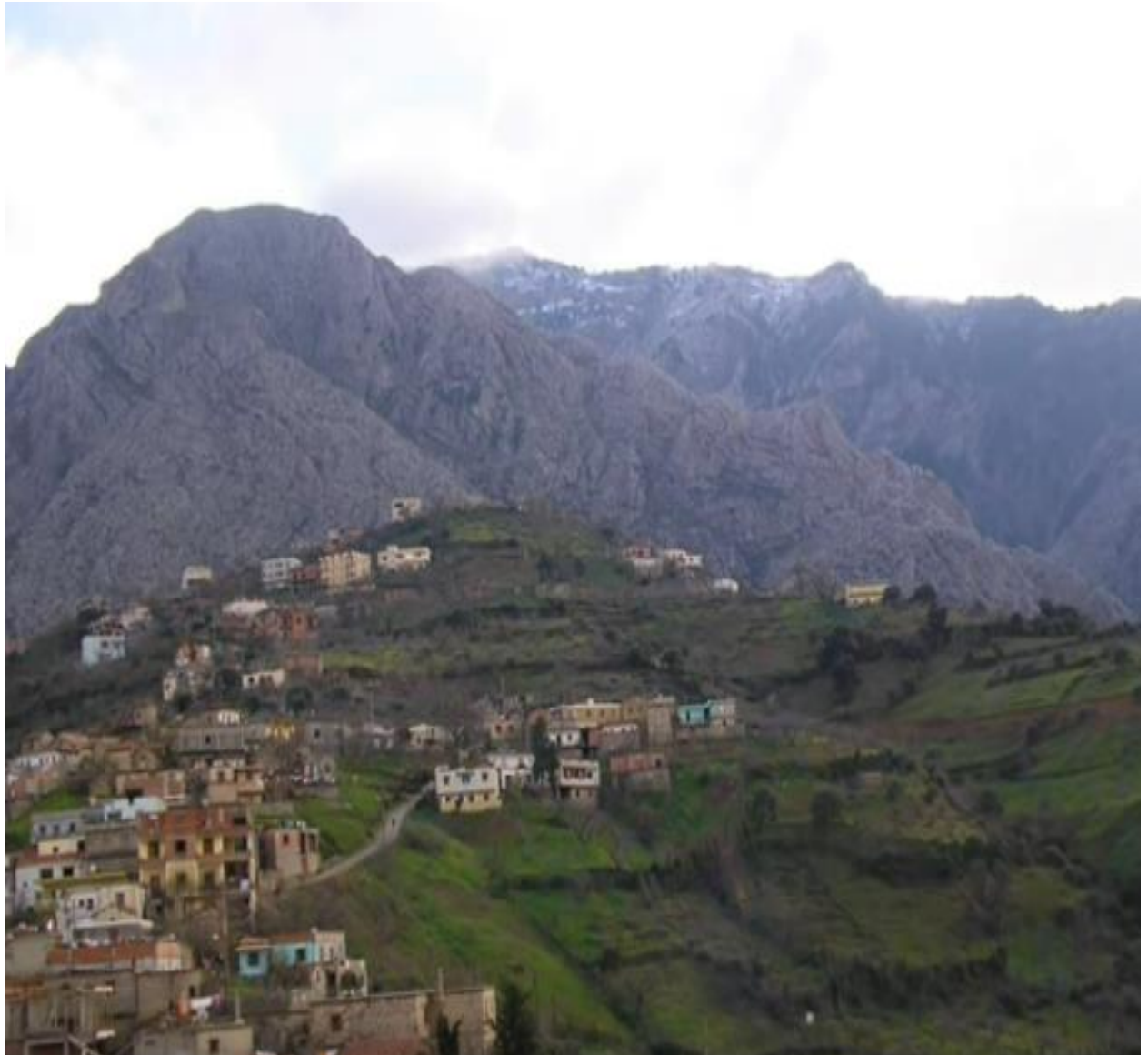
TUGNA TIS SETTA: TAMEQBERT N TADDART