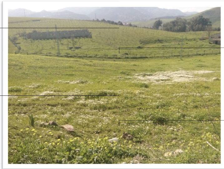
Leezib (At Mraw-Larebea n At Yiraten)