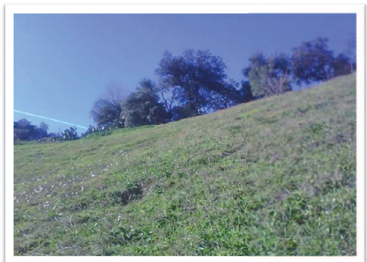
Iyil (Tawrirt- Larebæa n At Yiraten)