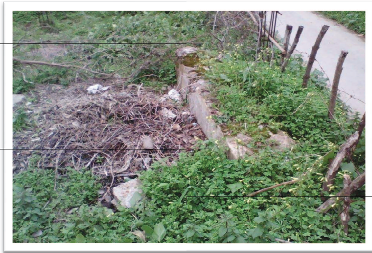
Tala εwin (Tigrin-Meqleε)