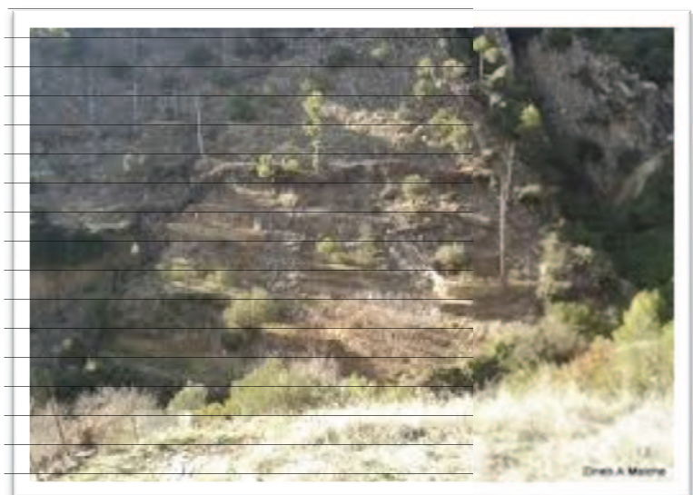
Asammer (Tizi n terga-Meqleε)