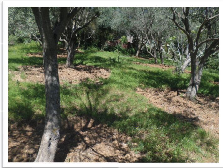
Aærqub (Iæzzuzen- Larebæa n At Yirten)