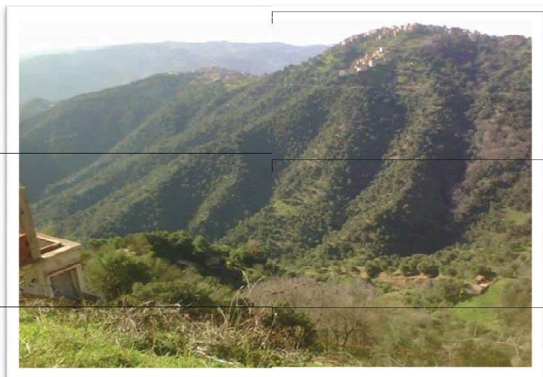
Iyzer n wass (Mişer- Larebæa n At Yiraten)