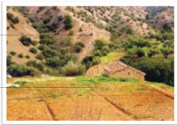
Tizewwayin(Agni n uεfir-Meqleε)