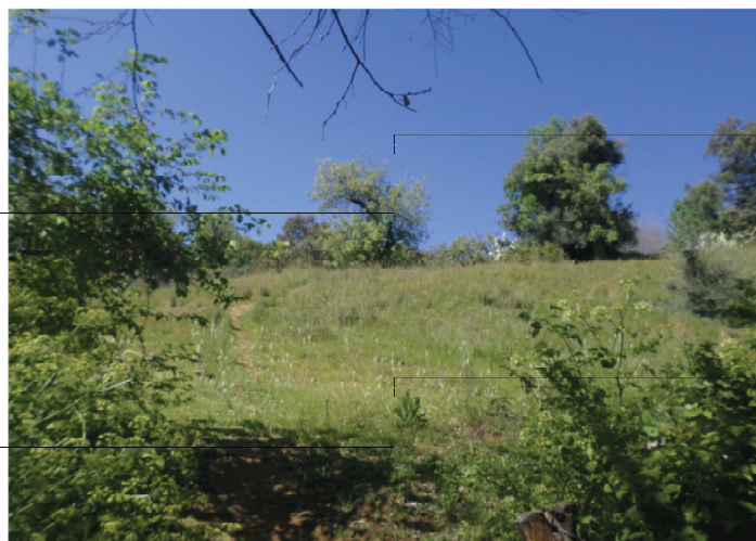
Uzzu( Taza- Larebæa n At Yiraten)