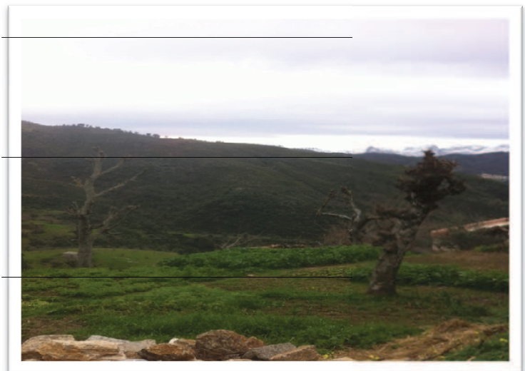
Amalu n Yixfawen (Mişer -Larebea n At Yiraten)