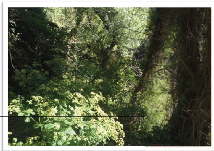
Amadey (At Menşur weḥmed- Meqleε)