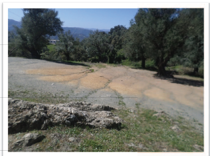
Annar n yiḥedducen (Iæzzuzen- Larebæa n At Yiraten)