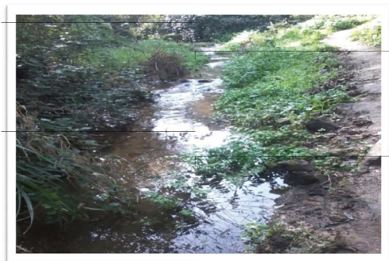
Iyzer n buḥellu (Lğemεa n ssariğ- Meqleε)