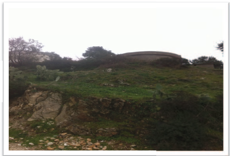
Lberj (Leyrus- Meqleε)