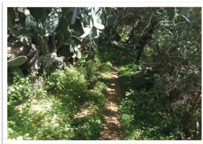
Amalu (Ixliğen- Larebæa n At Yiraten)