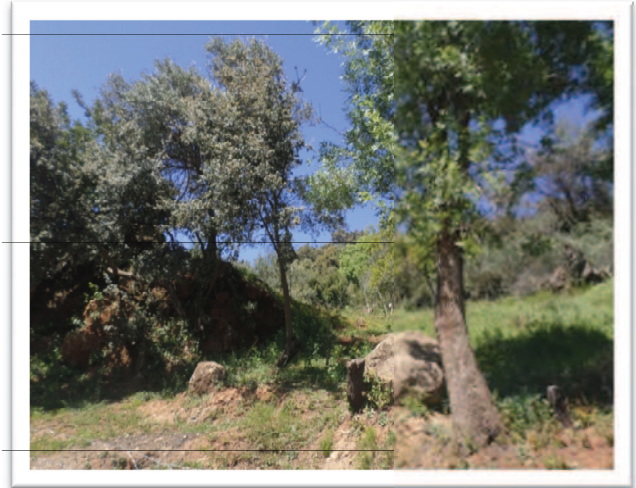
Tasqamut (Agemmun- Larebæa n At Yiraten)