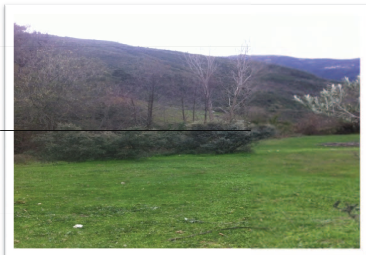
Tamazirt (Lmeşlub- Meqleε)