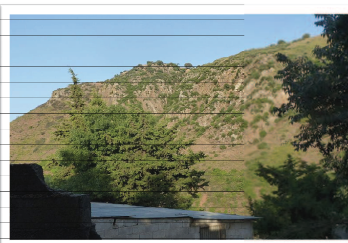
Tizi Naşer (Taza- Larebæa n At Yiraten)