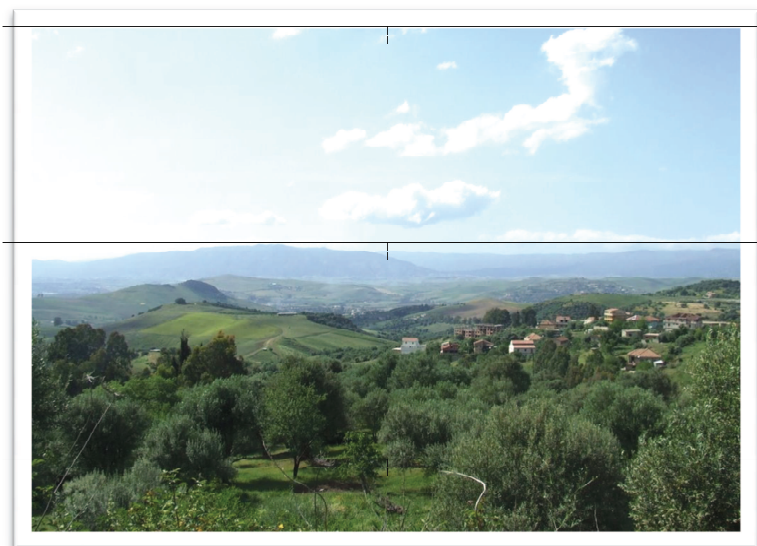
Tala Xlifa (Meqleε tamdint)