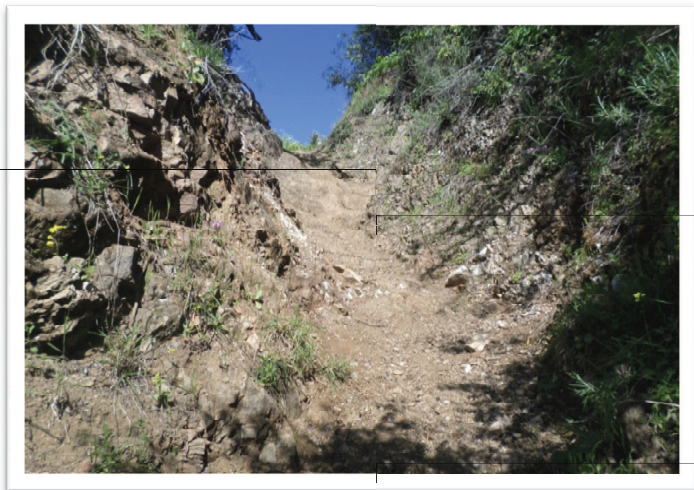
Iyil n uḍebbal (At Şṭelli –Larebæa n At Yiraten)