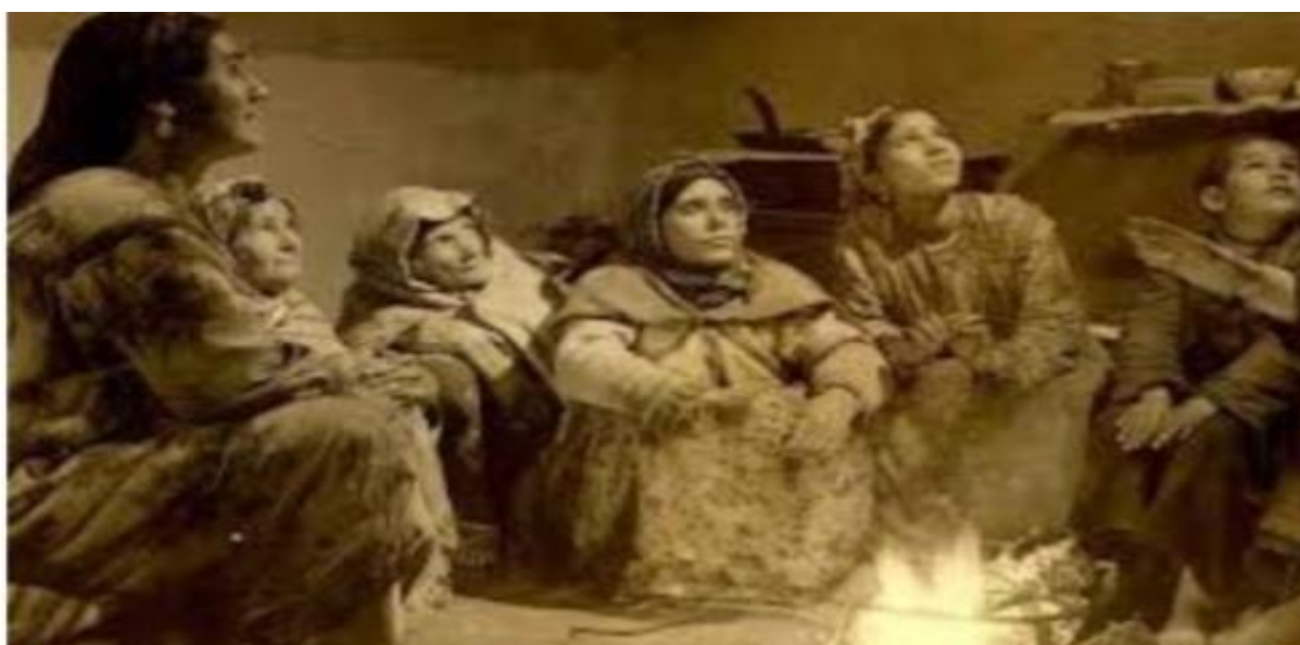
Anejme n yiæggalen yer Lkanun

https://aghucaf.wordpress.com/2020/07/24/lkanun-d-a%3Aerbaz-n-tutlayt-taqbaylit/