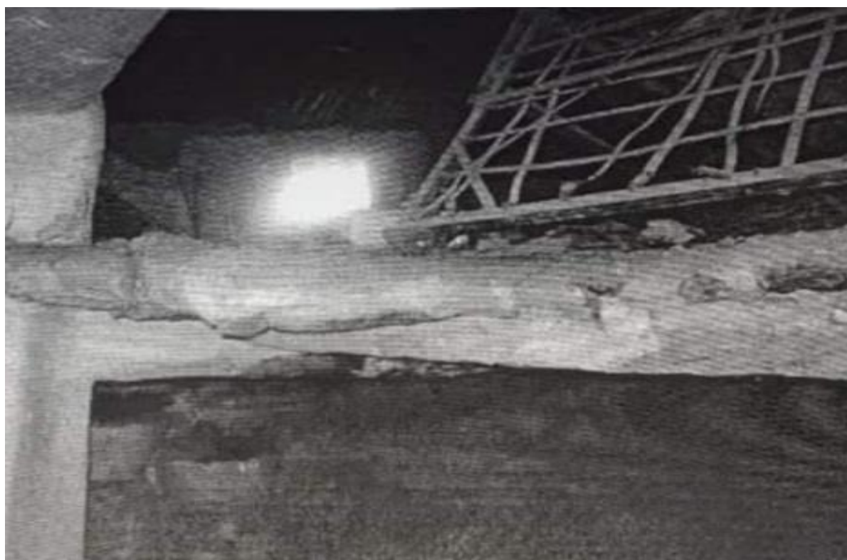
Taerict n uxxam aqdim n leqbayel