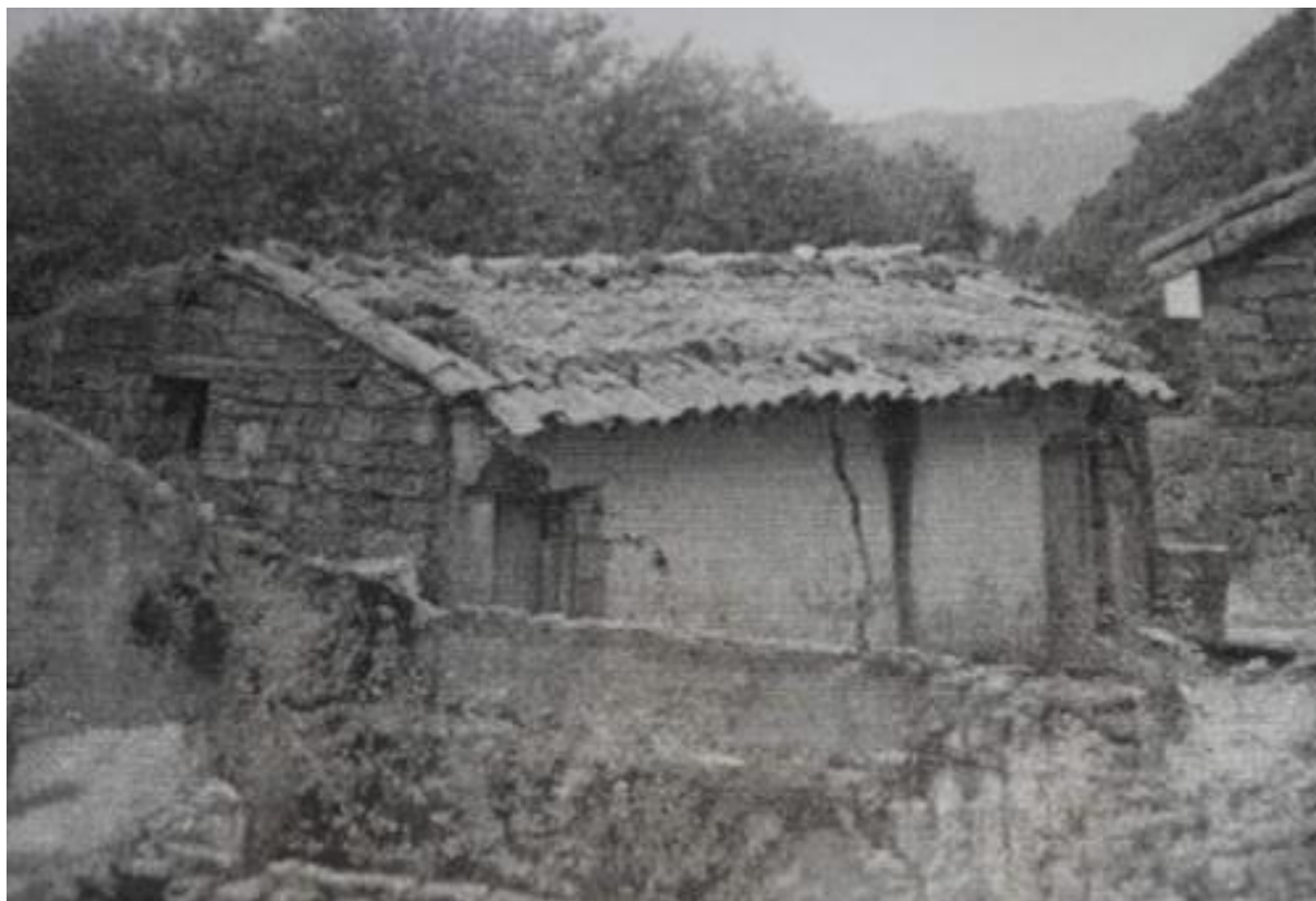
Axxam n leqbayel n zik