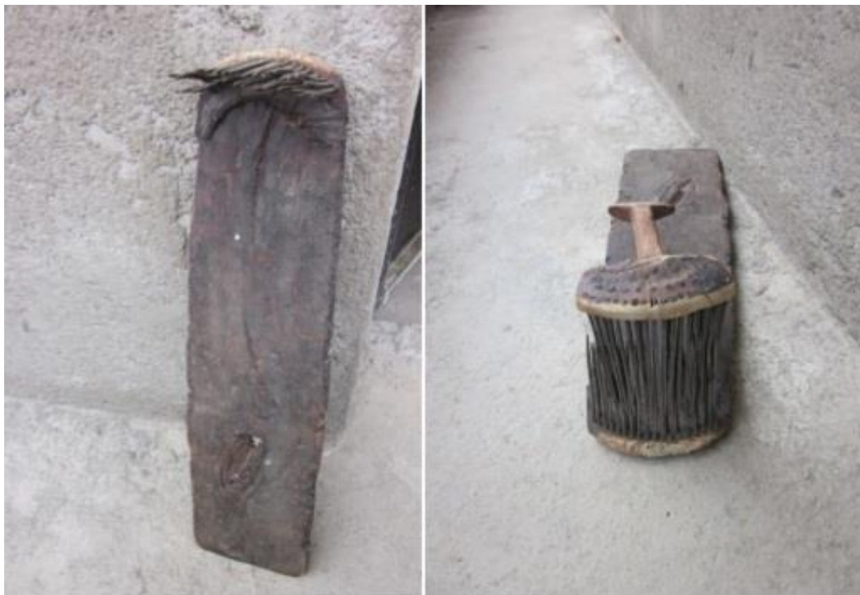
Imceđ d Talemdat