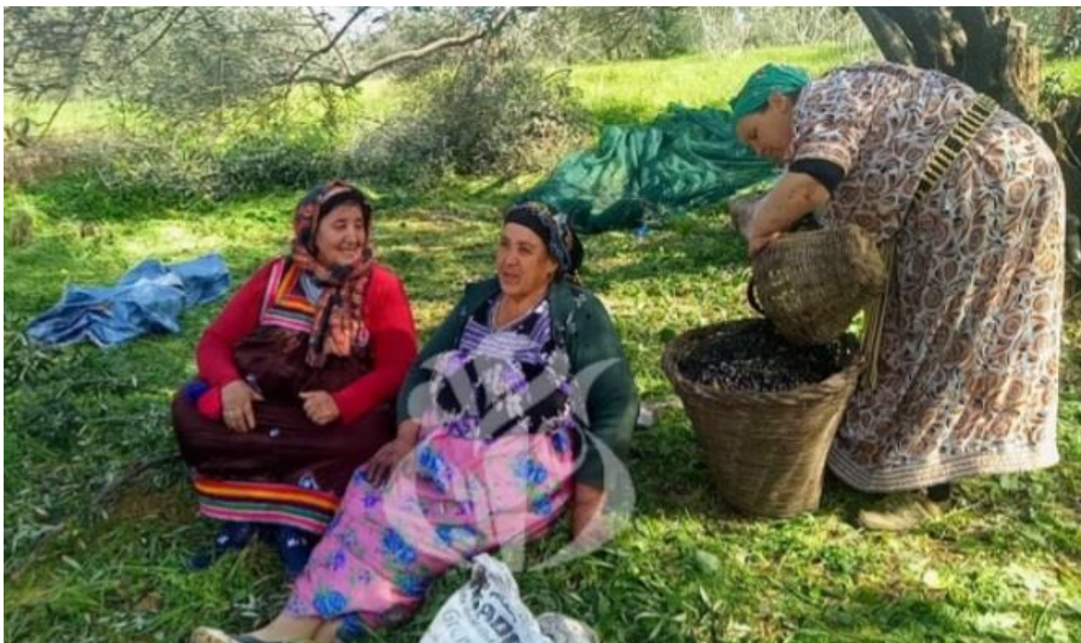
Alqaḍ n uzemmur

https://www.aps.dz/tamazight-tal/societe/66230-tiwizi-deg-tmurt-n-leqbayel-izlan-n-uzemmur-d-tigemmi-ay-yessefken-ad-tettwa-rez