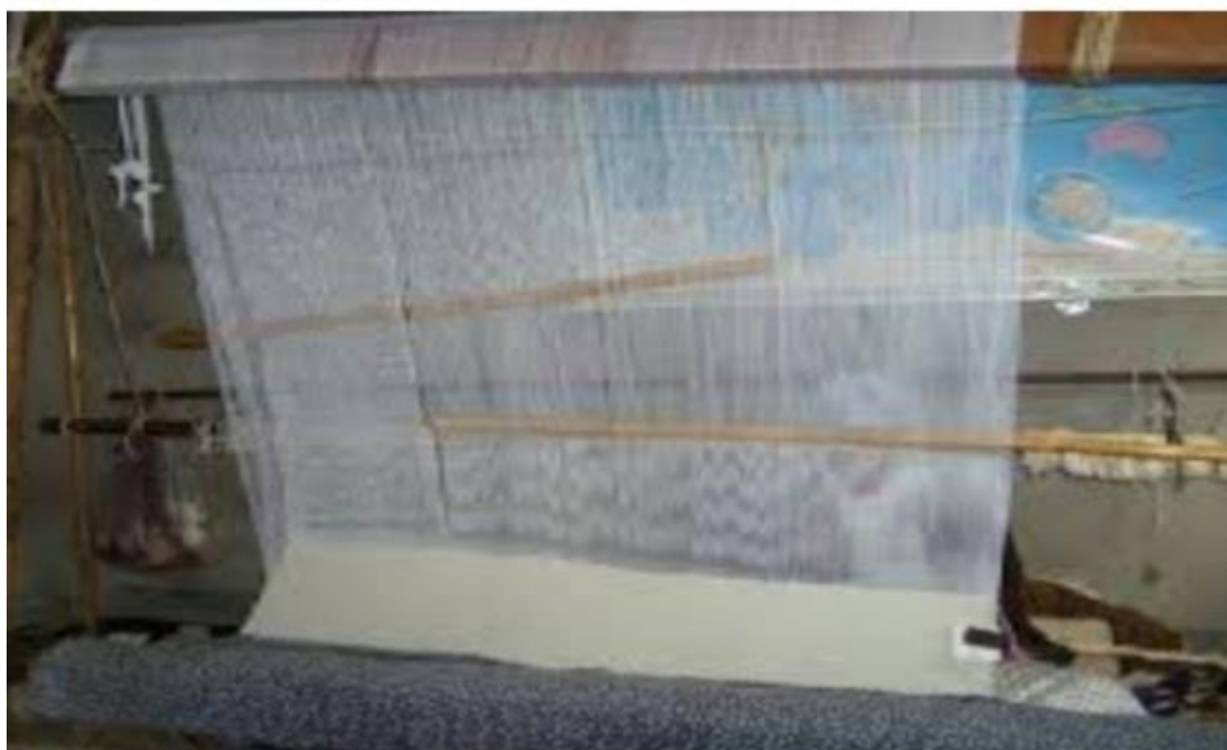
Azeṭṭa n leqbayel

https://www.aps.dz/tamazight-tal/societe/66230-tiwizi-deg-tmurt-n-leqbayel-izlan-n-uzemmur-d-tigemmi-ay-yessefken-ad-tettwa-rez