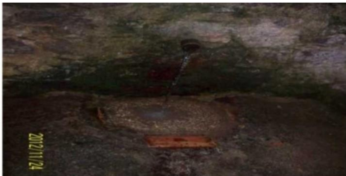
Tala n Buzehrir