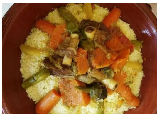
Seksu s uksum