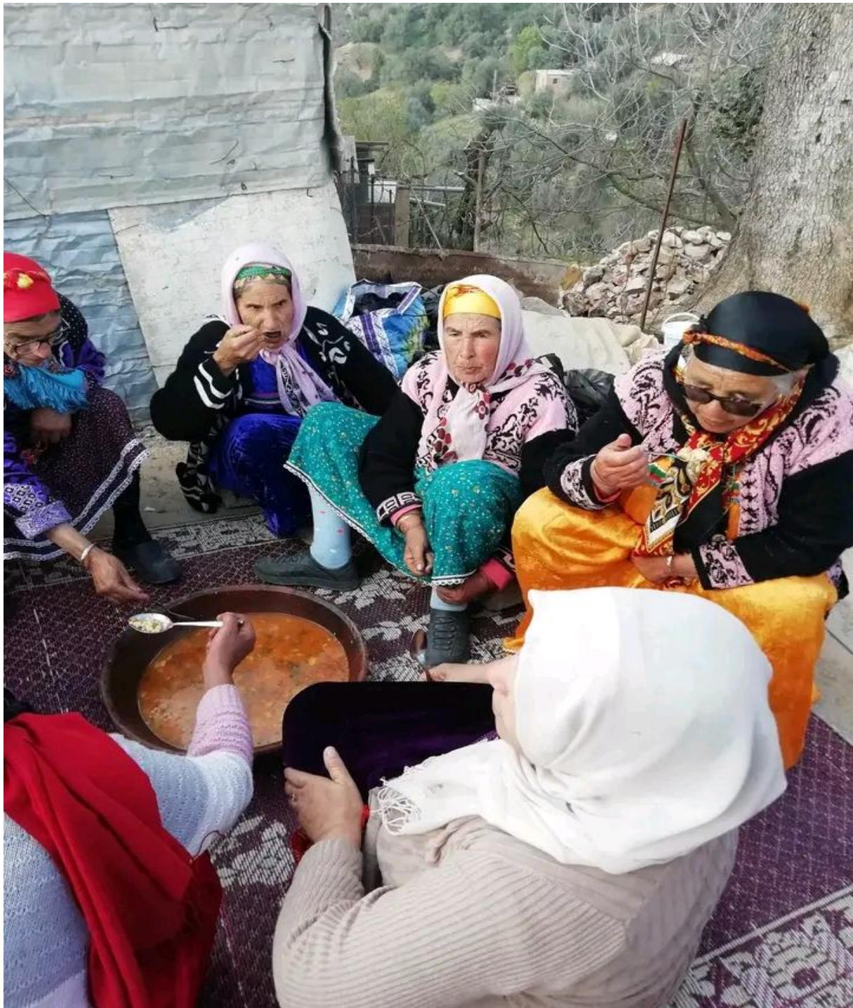
(Dayla-ntey, nexdem-itent-id deg taddart n At Ețella deg 20 yebrir 2019 asfugel n uyenğa n tefsut)