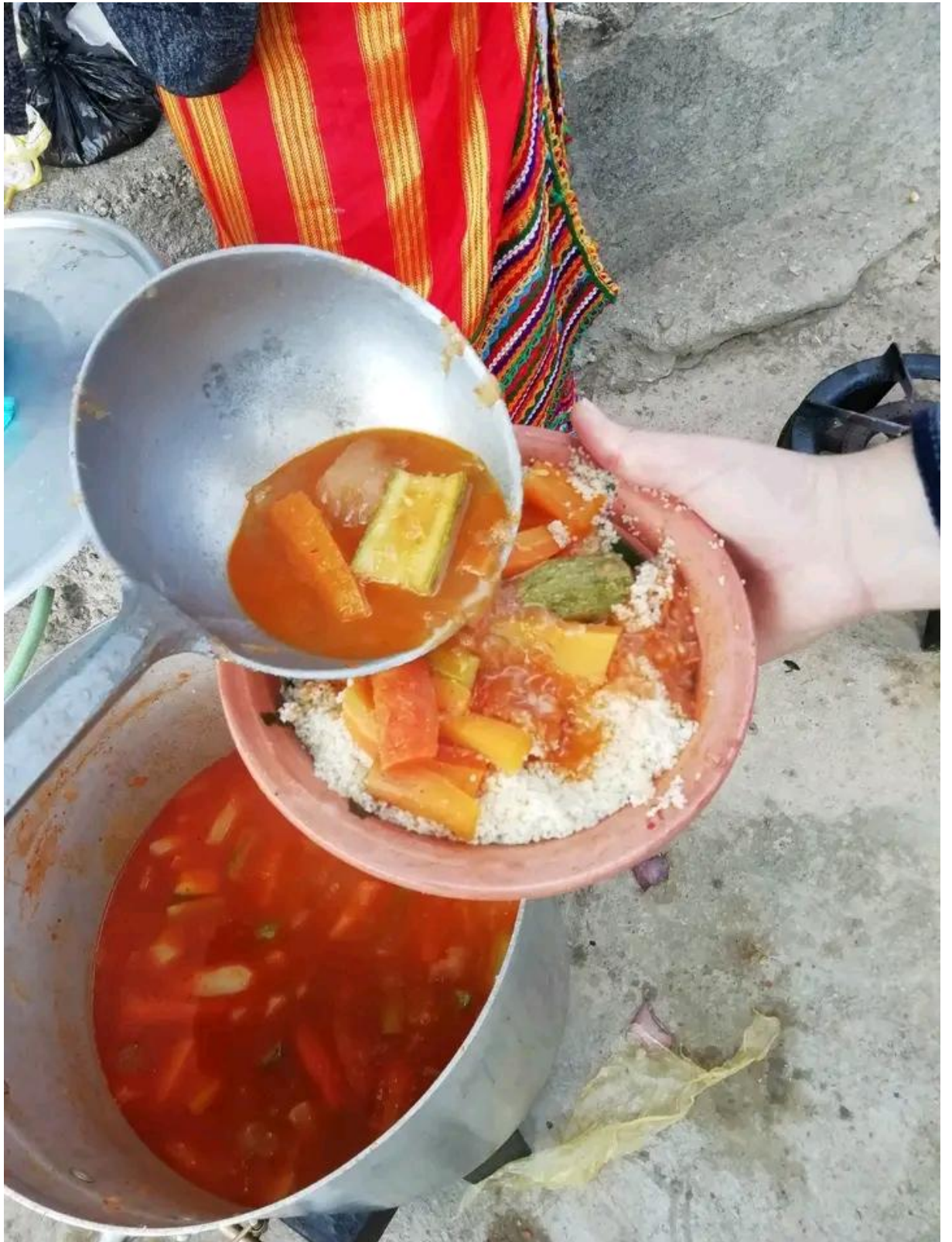
(Dayla-ntey, nexdem-itent-id deg taddart n At Eṭella deg 20 yebrir 2019 asfugel n uyenğa n tefsut)