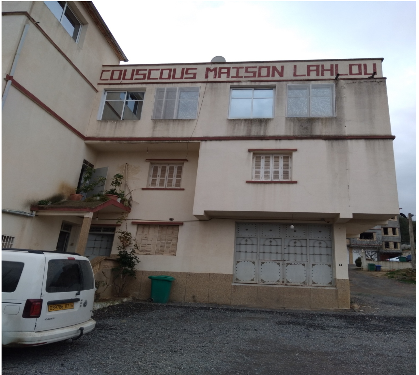
Tugna uṭṭun 03: Luzin n seksu Laħlu.