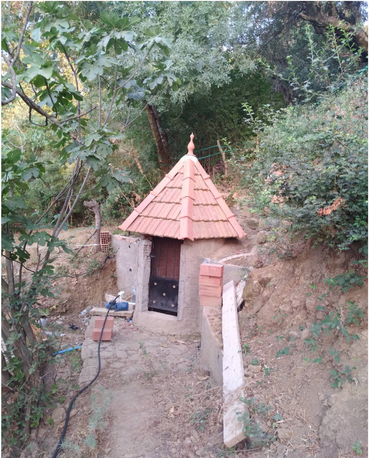
Tugna uṭṭun 02: Lbir yellan daxel n taddart n Ilaḥluten.