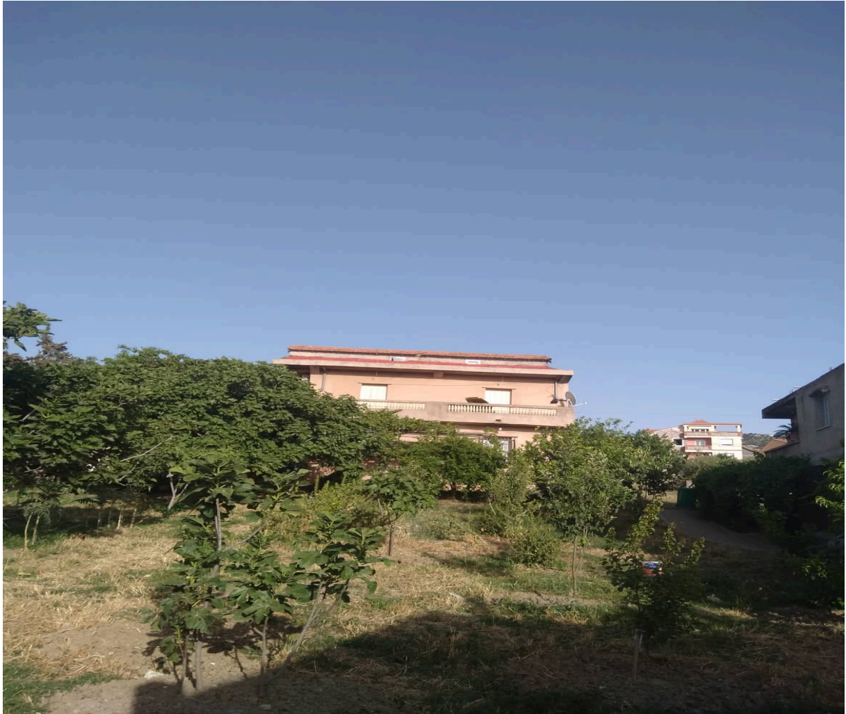
Tugna uṭṭun 02 : Ixxamen atraren n taddart.