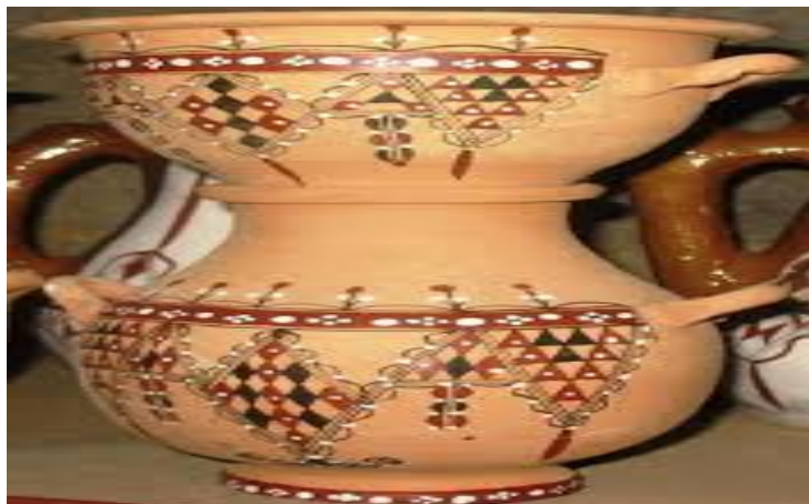
Tugna uṭṭun 01 :Taccuyt n ufexxar

llant tlawin i yettwassnen ttenantent ttruḥent-d tlawin yur-sent yer wexxam, syin akkin ad walint leṣnaf i xeddmnt, ma d tilawin ur ssinen ara medden amek ara d-rzun yur-sent ttawin-asant yergazen-nsent ney arraw-nsent ayen xedmen yer leqhawi ney yer tḥuna, ney znuzuyen-ten deg iberdan. Afexxar-a melmi inuda umdan fell-as, yewjed yella.