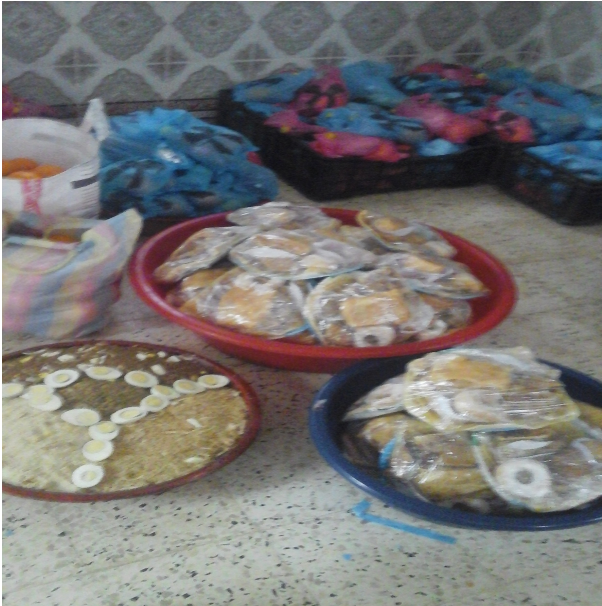
Tugna uṭṭun 01: Isufar n tuččit id theyyint tlawin di yennayer.