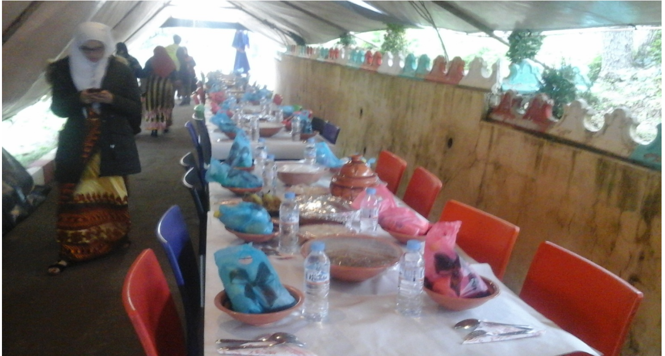
Tguna uṭṭun 02: acečči n n taddart di yennayer.