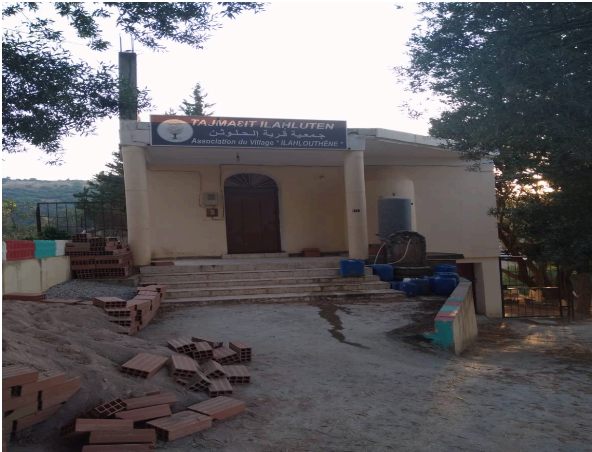
Tugna uġfun 03 : Taxxamt n unejmuε di taddart n Ilaħluten.

mi ara tesseu tameyra ney lġanaza, seg tzeqqa-agi id ttawin dduzan, mi ara tarrez tyawsa id uwin seg tzeqqa ad tyarmen, mi ara arren dduzan-nni yer tzeqqa, mi ara yili lferh iwumi itensxedmen, ad as-fken lwaeda mi ara yerren dduzan i tesqamut n taddart, iwakken ad tt-hareb yef ieggalen n twacult i qqaren. Taddart Ilahluten ur tessei ara leġwamee di taddart, leġwamee lan di tyiwant n Friqat yer din i rezzun at taddart, iwakken ad zallen, ma di taddart tella yiwet n tzeqqa anda i ttenejemaen imezday n taddart.