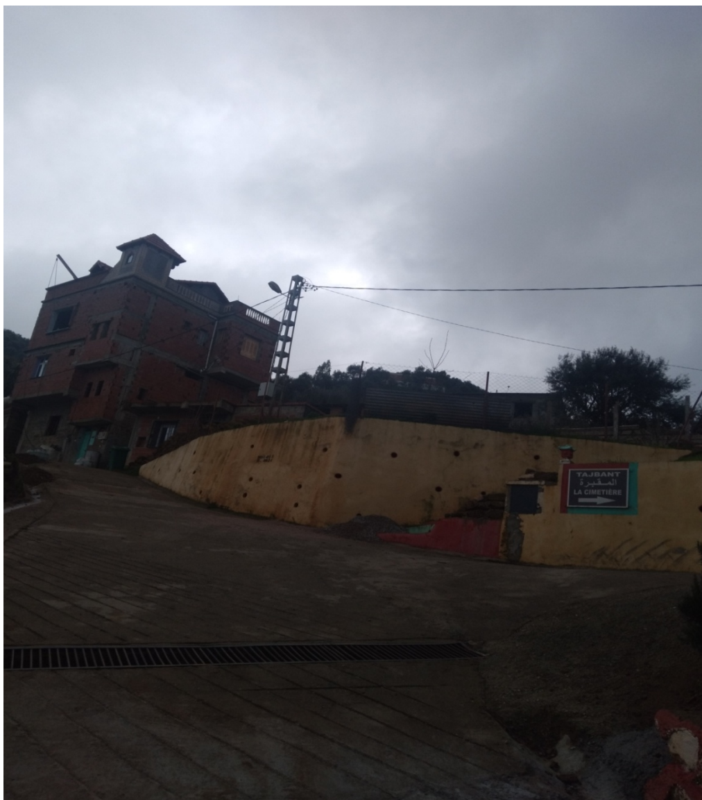
Tugna uţfun 01 : Taddart n Ilaħluten.