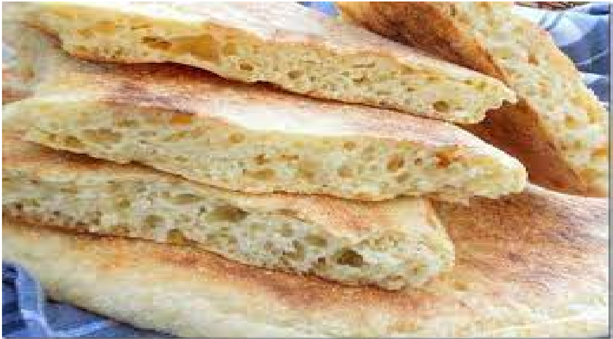
Tugna uţfun 04: Tamtunt.