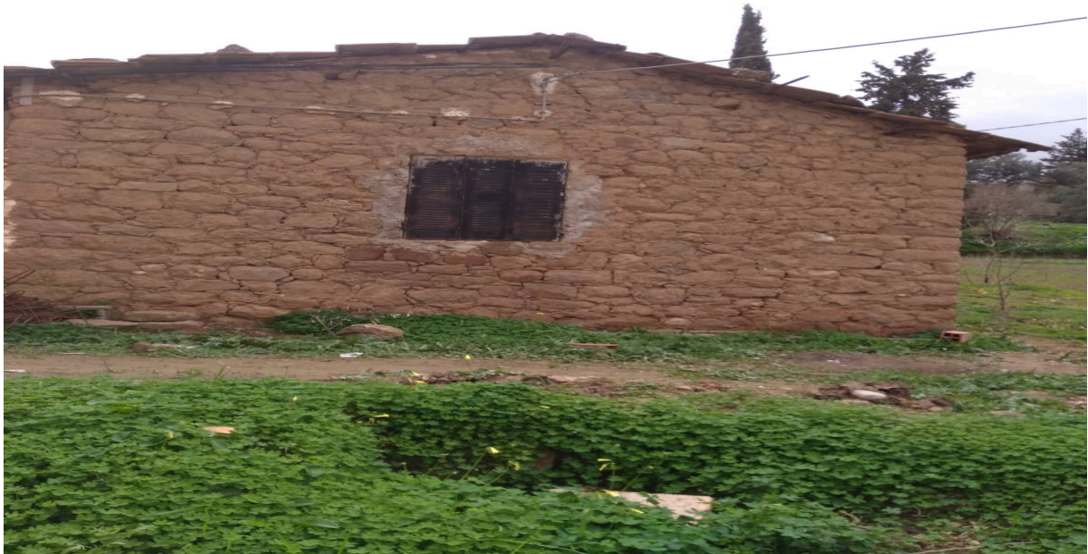
Tugna uṭṭun 01 : Axxam aqdimn taddart n Ilaḥluten.

Zik taddart n Ilaḥluten tebna ixxamen-is wa deffir n wayeḍ, tura llan imezday n taddart yeḡḡan ixxamen-nsen iqdimen ṣubben-d yer uzayar, bnan s talya nniḍen, talya tatrart, imi d ayen yifen liḥala-nsen deg yixxamen iqdimen, akken qqaren yal lweqt s lweqt-is, ixxamen iqdimen qqimen kan d ccawat yef zik-nni, yal ilemzi ad izeḡ amek id kkren lejdud-id d wamek ddren, d tudert qessiḥen εacen di tallit n zik, yef waya ar d naf lebni atrar yuget s waṭaṣ ii ttnadin akk medden yef tudert igerrzen, ad sgunfun deg ixxamen-nsen, dya ma netṭef amedya deg uxxam atrar ad t-naf yebna s lebrik, dixel yebḍa d tixxamin, yesea takuzint, abduz, tixxamin n tguni, tanwalt yesea ladal, ur yesei ara aqermud llan ixxamen atraren iwumi xeddmn aqermud n leqbayel i ccbaḥa kan, nezmer ad naf axxam yef wayeḍ, sin kraḍ ney ugar, agens d akarḷaj, leḥyuḍ-is d win isebyen s yiniyen yemxalafen.