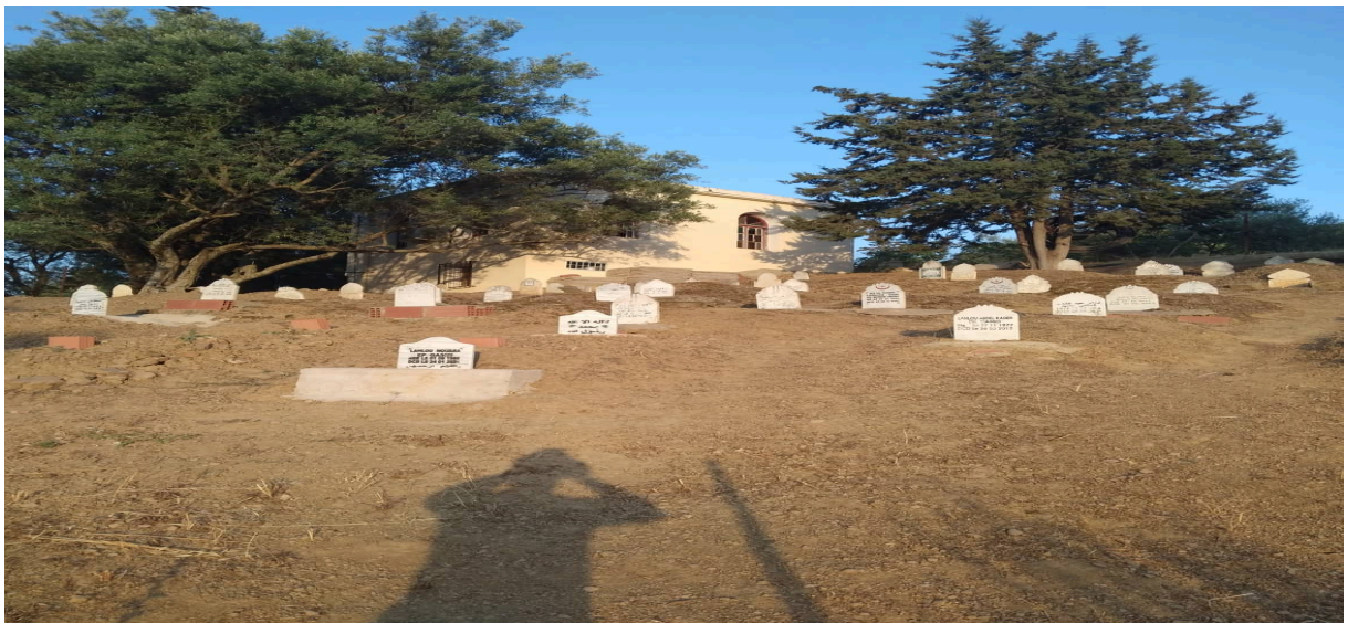
Tugniwin uṭṭun 05 : Tajebbant n taddart n Ilaḥluten.