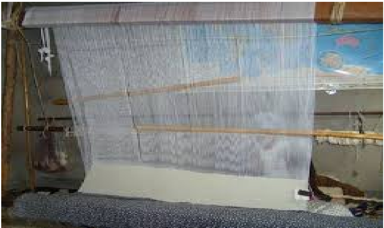
Tugna uṭun: Azetṭa n leqbayel.