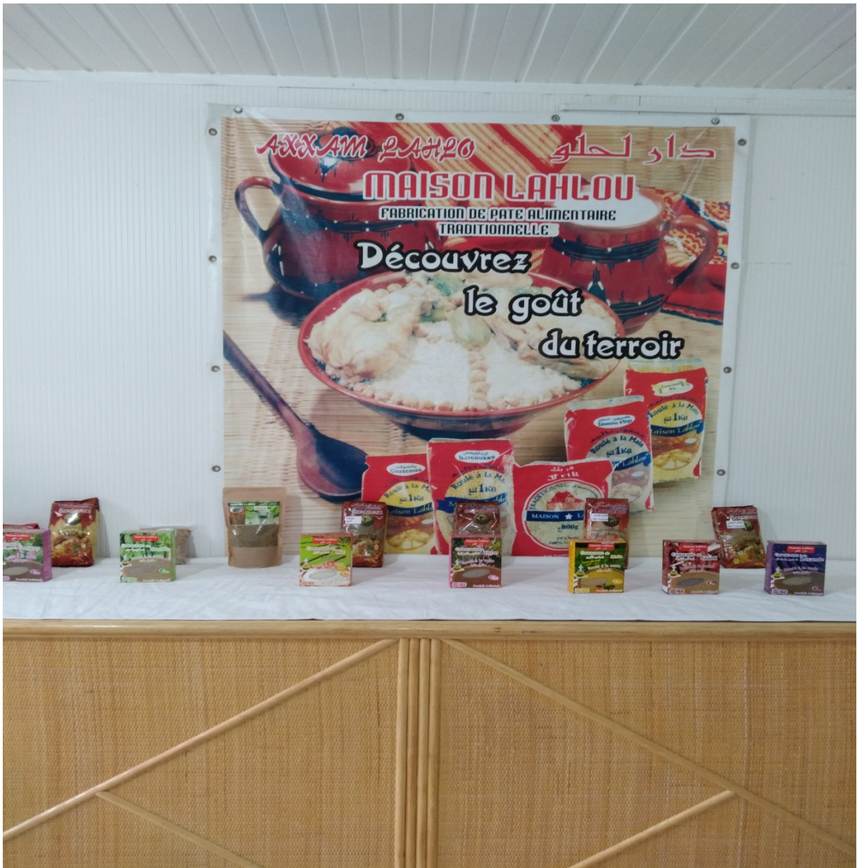
Tugna uđun 02: Asafar n seksu

Yimaziyen. d seksu i tetten inebgiwen d twaculin deg yal talemmitz am umenzu n yennayer.