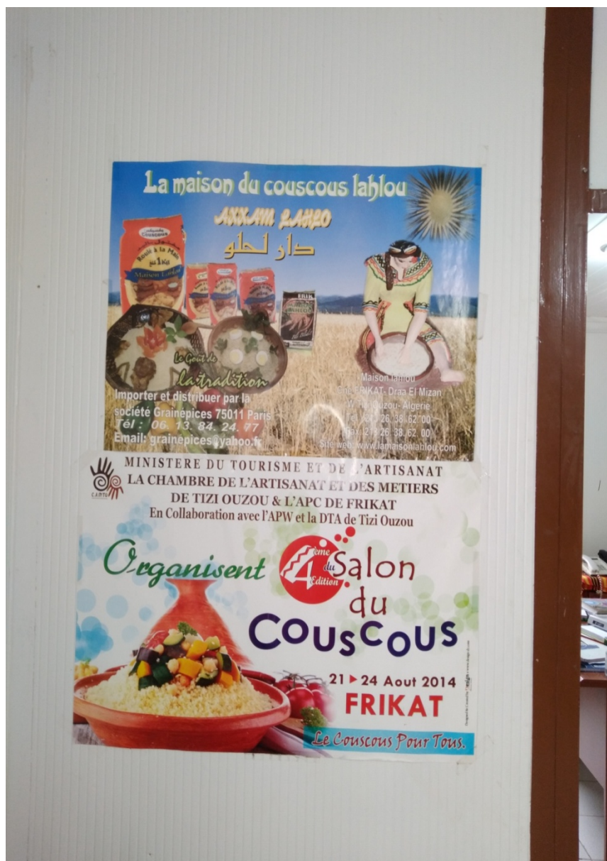
Tugna uṭṭun 01: Luzin n seksu, laħlu, ilaħluten, tayiwant n Friqat.

Deg yixef-a uwiy-d awal yef luzin n seksu Laħlu 1 , yeldin di taddart n Ilaħluten, uwiy-d yef umezruy n seksu, timental n uldi n luzin-a n seksu, iqeddacen deg uħric-a n lxedma n usafar-a n tuččit agejdan yer leqbayel, amek id yettili lefteil n seksu, leşnaf n seksu yellan, leşnaf n Berkukes, d umgired yellan gar seksu n tmacint d seksu yettwaftalen s ufus