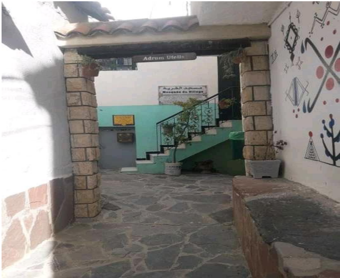
8 Ljamee n taddart