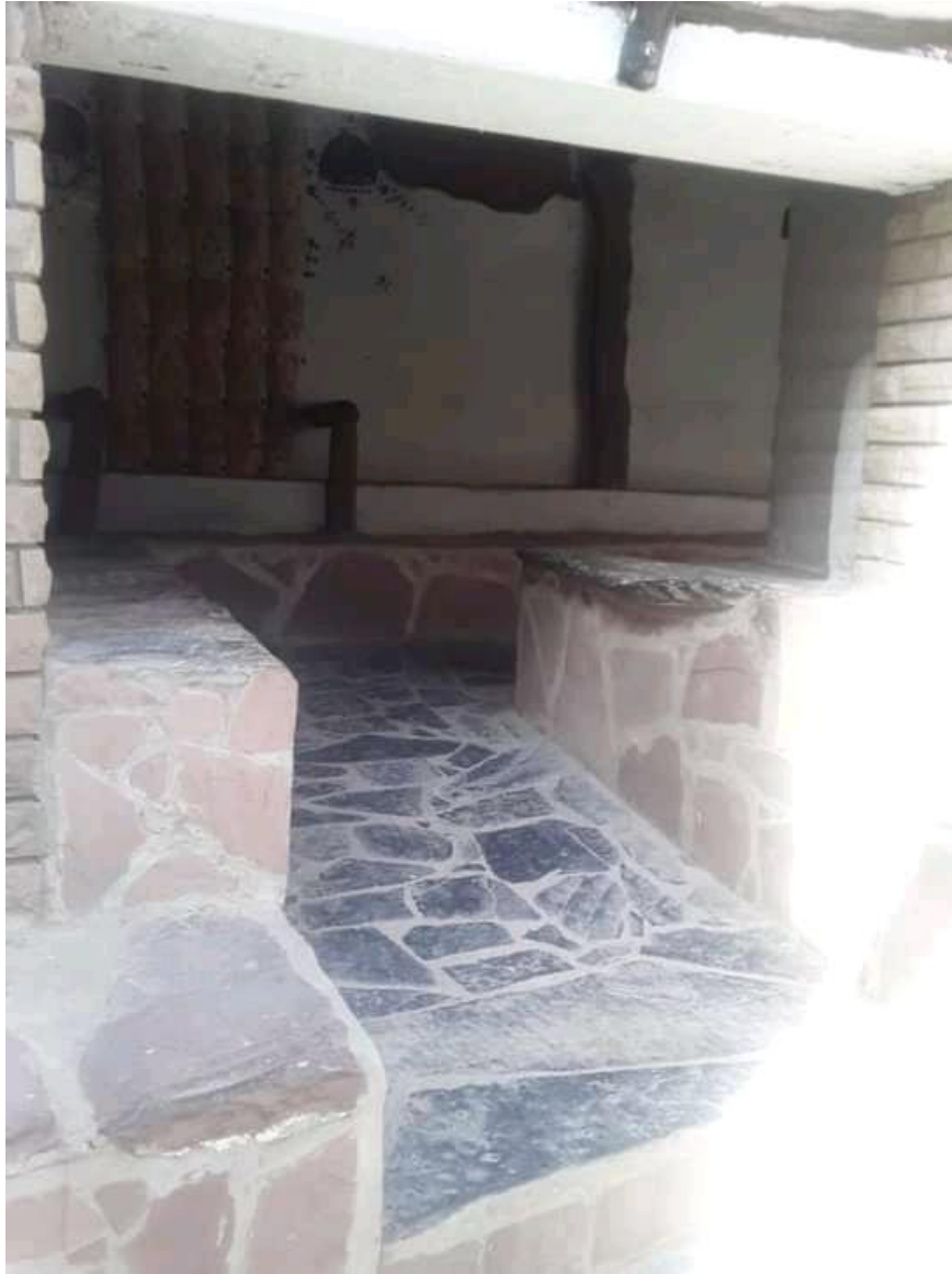
Tajmaet n taddart