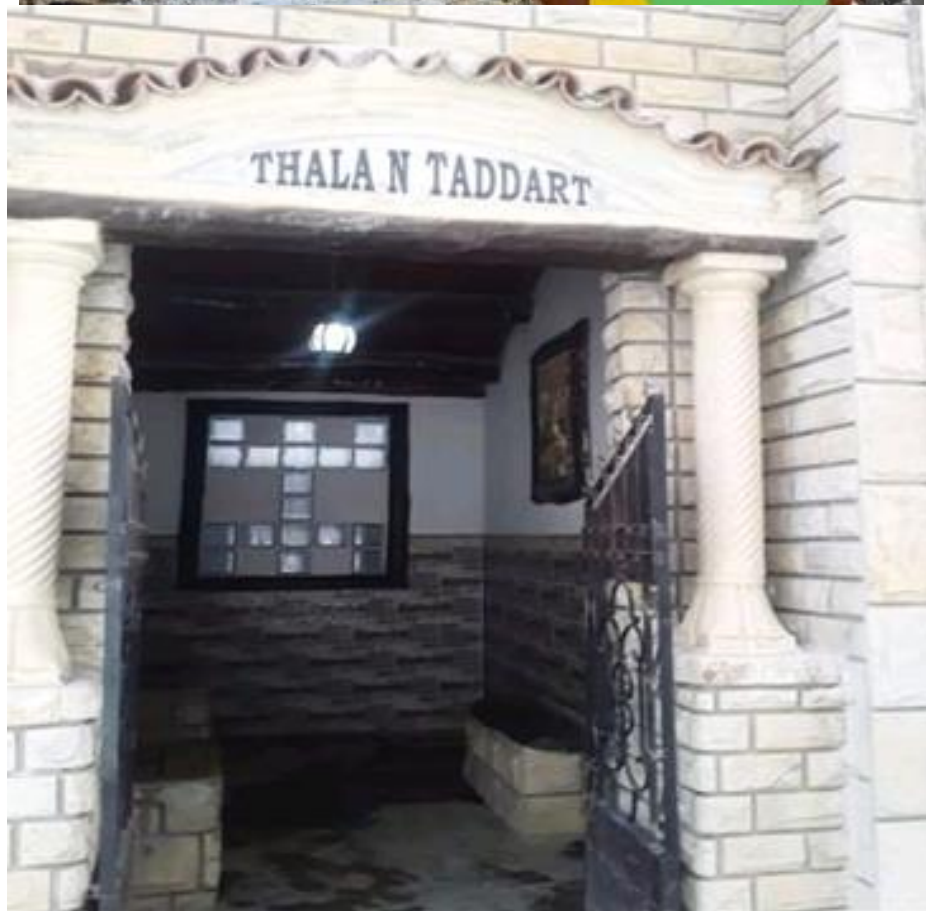
Tiliwa n taddart