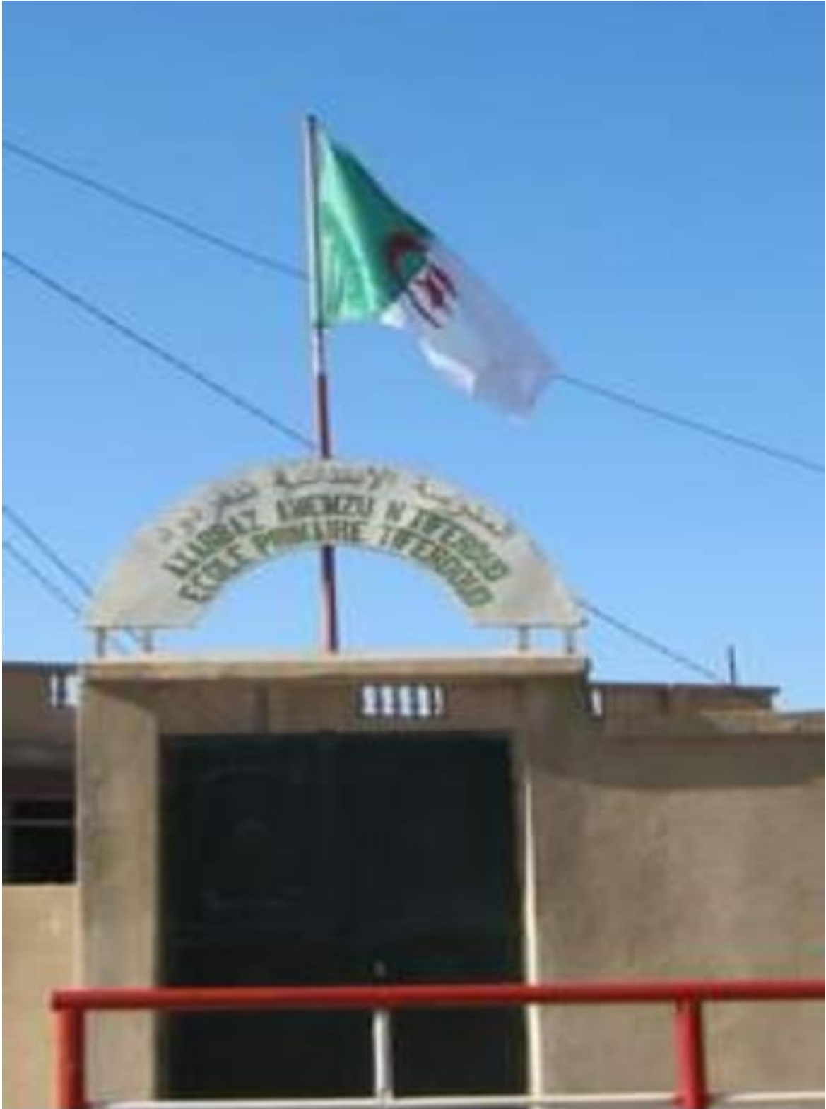
Ayarbaz amenzu n Taddart