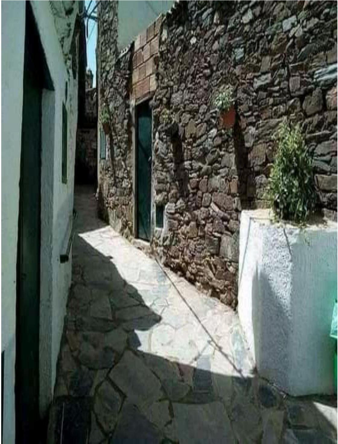
Azniq n taddart