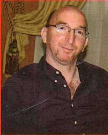
Tugna syur Rabie Vah