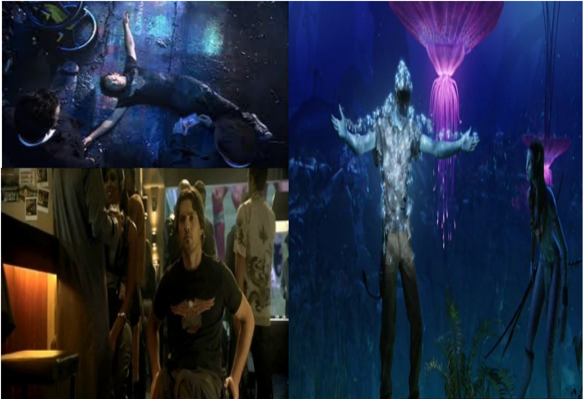
Picture 11: Representation of Avatar's principal character, Jake Sully.

Referring to Camus's L'Homme Révolté (1951), Ian Watt considers Kurtz as “a savage god” (Ibid:44)