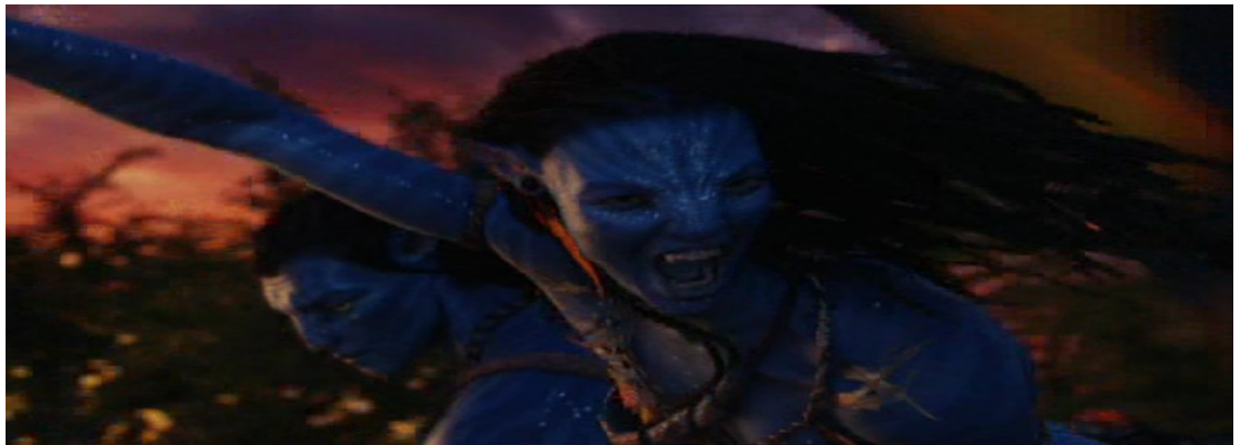
Picture 4: Neytiri is riding with Toruk Macto (Sully is the “leading” warrior). The blue color of the skin amplifies the exotic image of the Na'vi.

“Them”; the spirits of the forest and the capacity to communicate harmoniously with them. The female character (actor) Neytiri has central role in the movie in helping to affirm the superiority of the main actor, Jake Sully. Surprisingly, the “other” in Cameron's Avatar can be seen as a reincarnation of Montaigne's cannibal, in his way of evoking wonders and mysteries and, at the same time, offering a patent idea of what is not to be civilized. The relationship between Jake Sully and Neytiri reminds us about captain John Smith and Pocahontas, a well known story which goes back to the first English settlement in today's America. A relationship in which we can consider as an allegorical marriage between the colonialist masculinity and the colonized femininity, marking the apotheosis of imperialism.