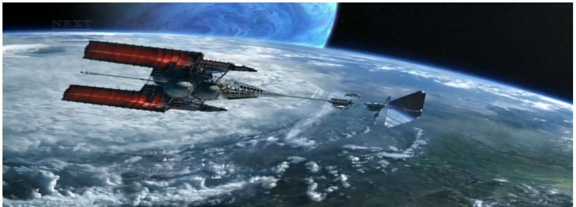
Picture 3: Spaceship in Cameron's Avatar . Its cylindrical form presupposes the masculinity of the Ideal Self (the West) penetrating the territory of “Pandora”, the green planet (the first woman in Greek mythology).

Assault-Ship' which is “a heavy transport and assault aircraft used by the Resources Development Administration (RDA) as a support during small incursions into otherwise hostile territory [...]” (Source: Avatar-James-Cameron-Avatar.wiki.com ). This aircraft ship is used by the company to survey the “hostile” territory of Pandora and, of course, to eliminate any kind of resistance. Among other vessels used in space explorations there are SecOps (Security operation). These flying machines, like helicopters, are serving “a mercenary force on Pandora (Ibid). These materials can be regarded as tools of knowledge to control the “unknown” environment. Additionally, I suggest that the way the movie's producer, James Cameron, has managed to show the US military technological advancement in a futurist and fictional space is to affirm and assure the continuity of cultural discursive of colonial power in the current space and time.