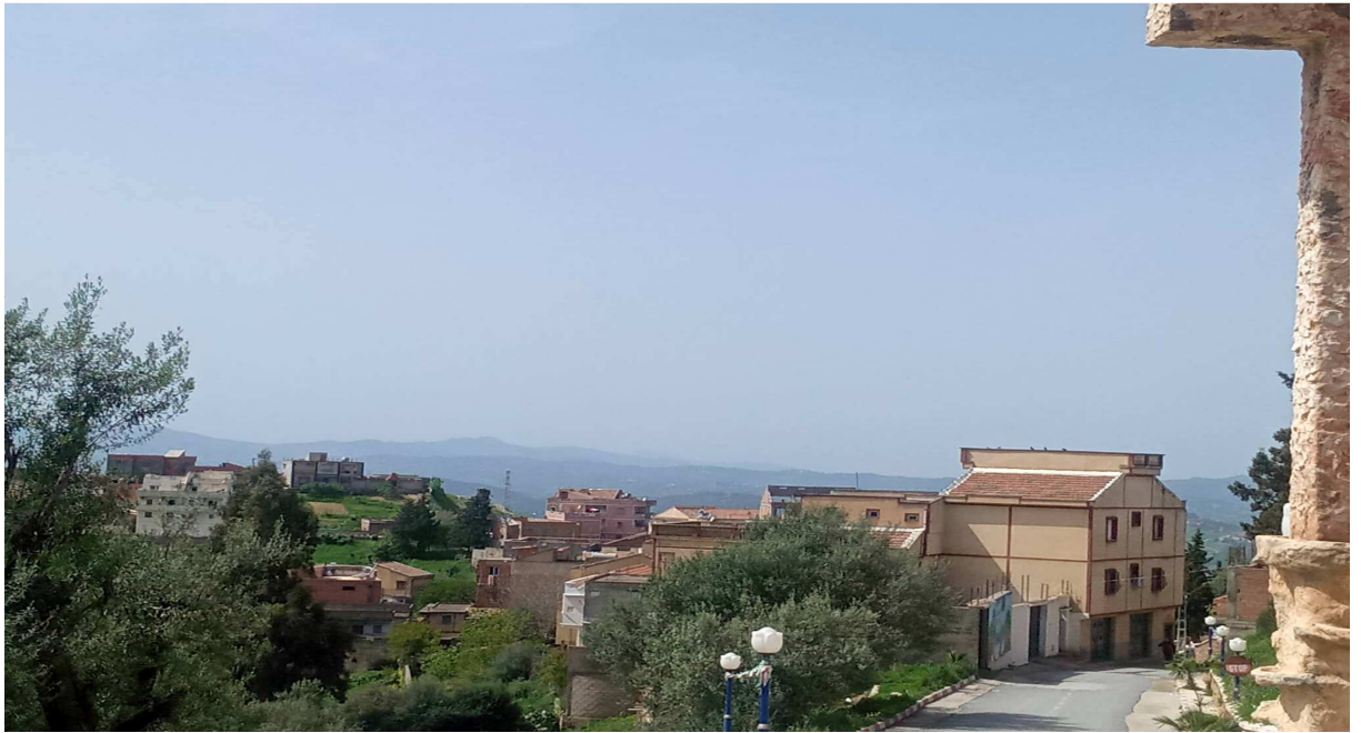
Tugniwin uṭṭun 01: Taddart n Icerqiyen