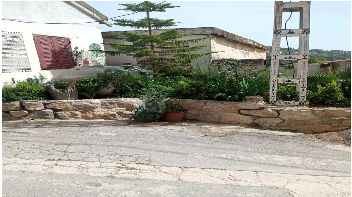
Tugniwin uṭṭun 04: Ccbaḥa n yizenqan n taddart d tezdeg-nsen.