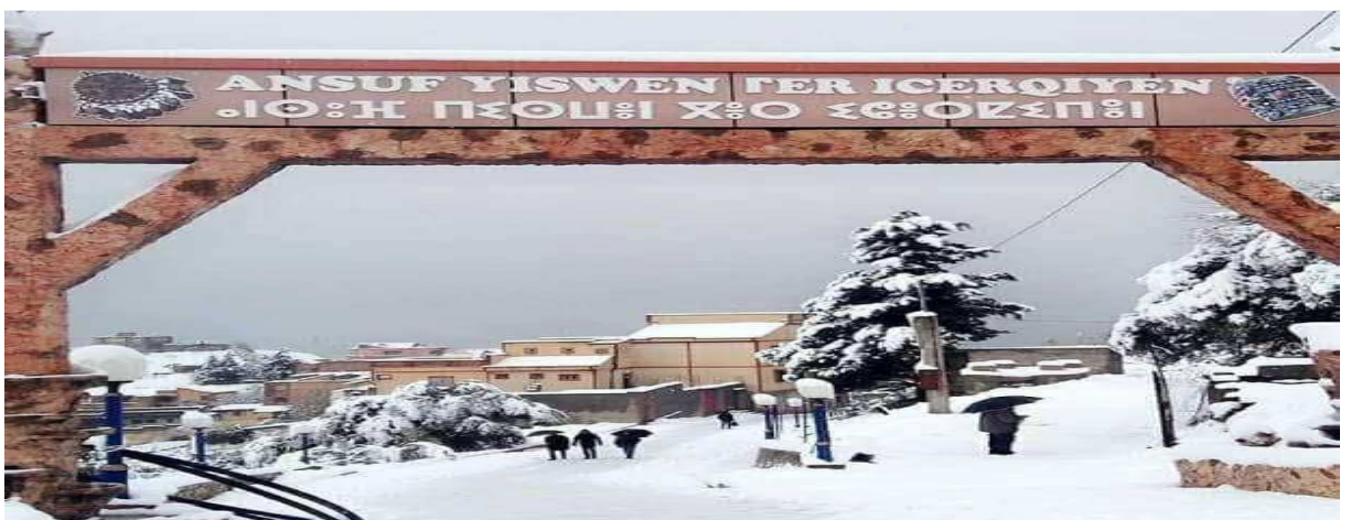
Tugna uṭṭun 02: taddart n Icerqiyen deg tsemhuyt n tegrest.

Anezwi n taddart n Yicerqiyen am win temnaḍin akk i d-yezzin i yillel agrakal, akken dayen ur yemgarad ara yef win n Meatqa acku deg-s i d-yezga. Llant snat n tsemhuyin tigejdanin : tagrest tasemmaḍt di ccetwa d unebdu aḥmayan, akiwan maca tagrest deg-s talemast ur teqsiḥ ara mliḥ acku ur yekkat ara wedfel s waṭas, anebdu musnaw s tfesniwen aelayanin maca tameddit n wass yettili ubeḥri.