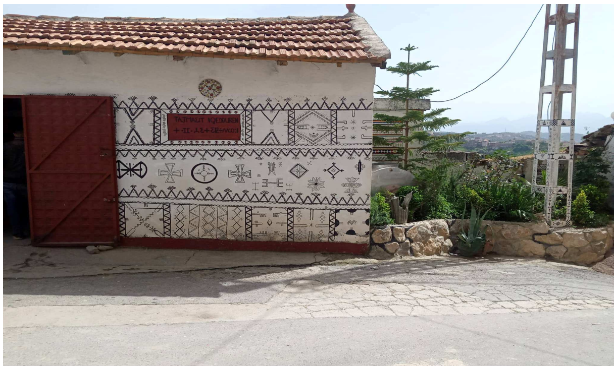
Tugna uřun 01: Taxxamt n tejmaet di taddart n Icerqiyen

Tajmaet n taddart n Yicerqiyen 2 d tin i d-yezgan di tlemmast n taddart, ur tebeid ara atas yef lğamee, tesa abrah anda tnejmaeen deg-s, krađ n yiddukkannen ttyaman fell-asen, tesa snat n tewwura, tseqqef s uqarmud.