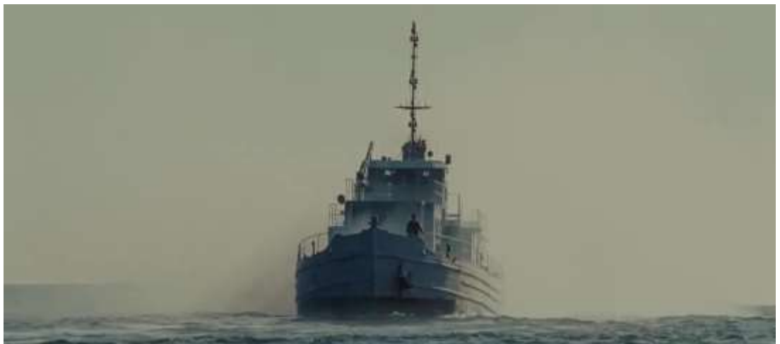
Figure 1: The Opening Sequence in Shutter Island (Scorsese, 2010, 01:05)

The aim of this section is to show how Scorsese creates his own perspective and the interpretation of Teddy's double trauma in the movie. Scorsese makes the audience experience the fantasy world of Teddy in order to understand what is happening inside the brain of a traumatic person. Lars Elstroms claims: "to communicate is to share ideas, thoughts, emotions and understandings. I call this share entity cognitive import" (Elstroms, 2019, p.22) The director plays with the allusion to create an unreliable reality. The reality is in front of the viewer from the beginning of the movie but they are not able to see it because they are just focusing on Teddy's point of view.