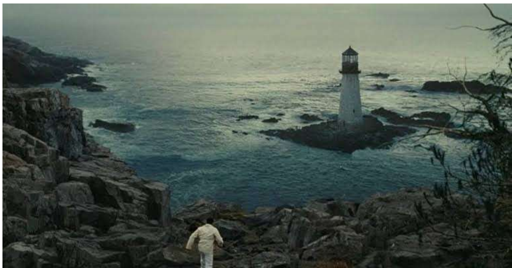
Figure 14: The Truth and the Light House (Scorsese, 2010,01:42:58)

Teddy makes his way to the lighthouse but he failed to reach there. He finds a woman hiding in cave, she says that she is the real Rachel Solando and explains that she was a former psychotropic at Aschecliffe and they are practicing illegal experiments on patients but the reality there is not any Rachel Solando. It is just a character created in Andrew's mind. He is confused and returns to the lighthouse. Here Dr. Cawley's goal is to push Teddy to confront his destination.