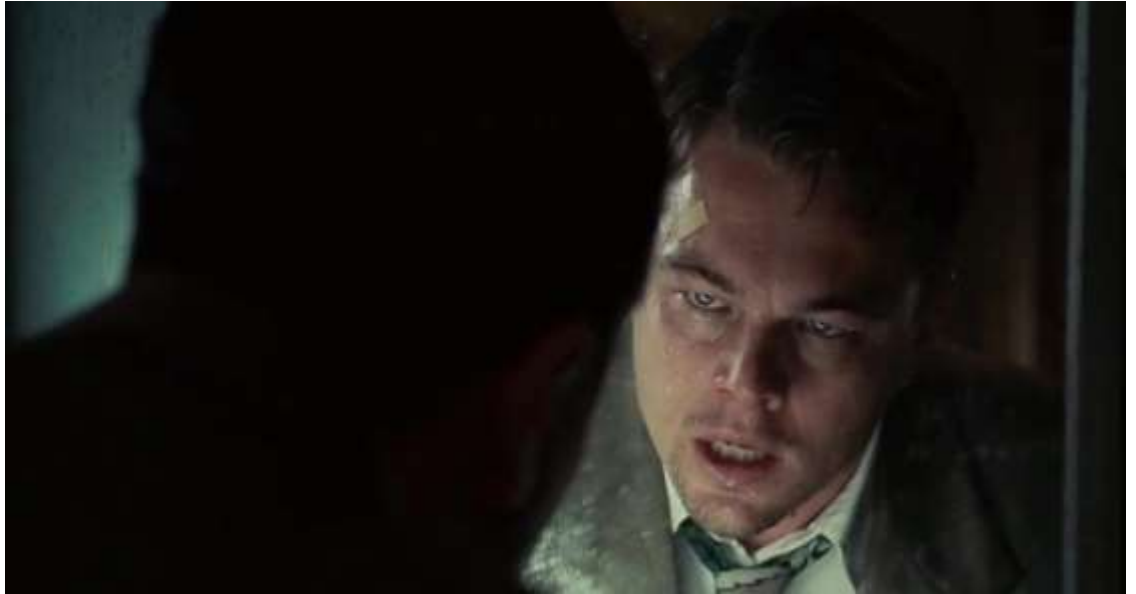
Figure 2: Teddy's Thallasophobia (Scorsese, 01:14)

The image above shows teddy inside the ferry. The fact of seeing the main character from a mirror at the first time is a hint that what is shown in the screen is not real. And he is quiet annoyed by the water and speaking to himself: “pull yourself together Teddy, it’s just water, it’s a lot of water” (Scorsese, 2010, 01:14) This explains that Teddy suffers from thallasophobia that is the profound anxiety toward the ocean and water or the fear of unknown depths.