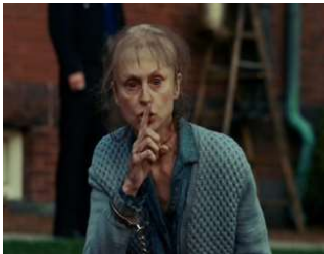
Figure 9: Iron Shackles as a Security measure at the institution

As it is shown in figure 10, a creepy lady smiling and staring at them especially at Teddy. The guard look very careful and keep their eyes on every patient. This adds a feeling of danger and doubt to the viewer and shows that this hospital is not safe at all.