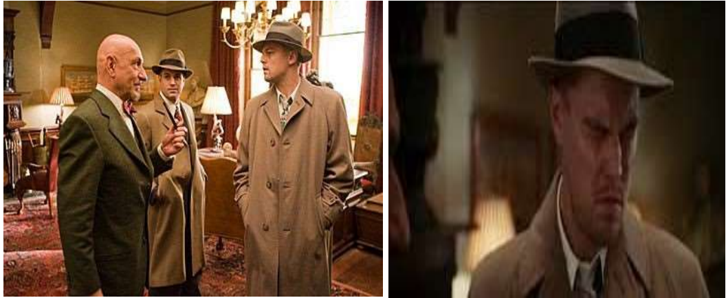
Figure 11: the first treatment technique used by Dr. Cawley (Scorsese, 2010, 09:58)

As it is shown in the figure 11, doctor Cawley gives clues about the patient 67 to refresh Teddy's memory. He makes it clear to Teddy how he is against old school techniques of treatment-locking patients. He says how today the new school techniques such as pills and isolation is more effective to real hard cases. Cawley believes that new school deals with patients rather than making them like zombies. He believes that if you treat a patient with respect and try to understand him, you can cure him. this new school of treatment aims to help patients in order to understand the roots of their trauma in caring and effective way whereas the old school of treating mental health issues often use risky procedures such as a brain s and surgeries like lobotomy. In this kind of surgery, doctors remove parts of the nerves in order to take the parts of their memories but it makes them like docile bodies.