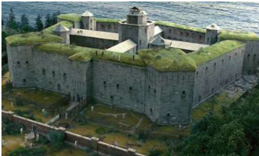
Figure 8: Ashecliffe Hospital ( Shutter Island , 2010)

As their arrival to the island, Teddy and his partner Chuck meet the guards and go directly to Ashecliffe hospital to start their investigation.