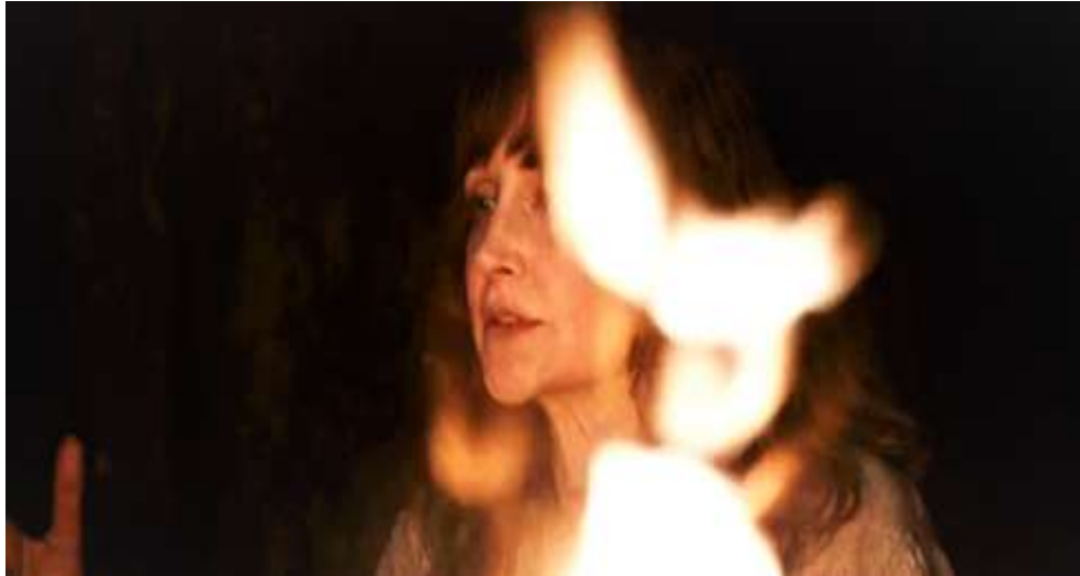
Figure 20: Rachel Solando in Teddy's Fantasy world (Scorsese, 2010, 0:29:53)

Overall, Martin Scorsese utilizes as potent symbol to underscore's the film's themes. Adding fire into the narrative and visual imagery, he creates a special cinematic experience that invites the audience to deepen in the story and adds an emotional impact.