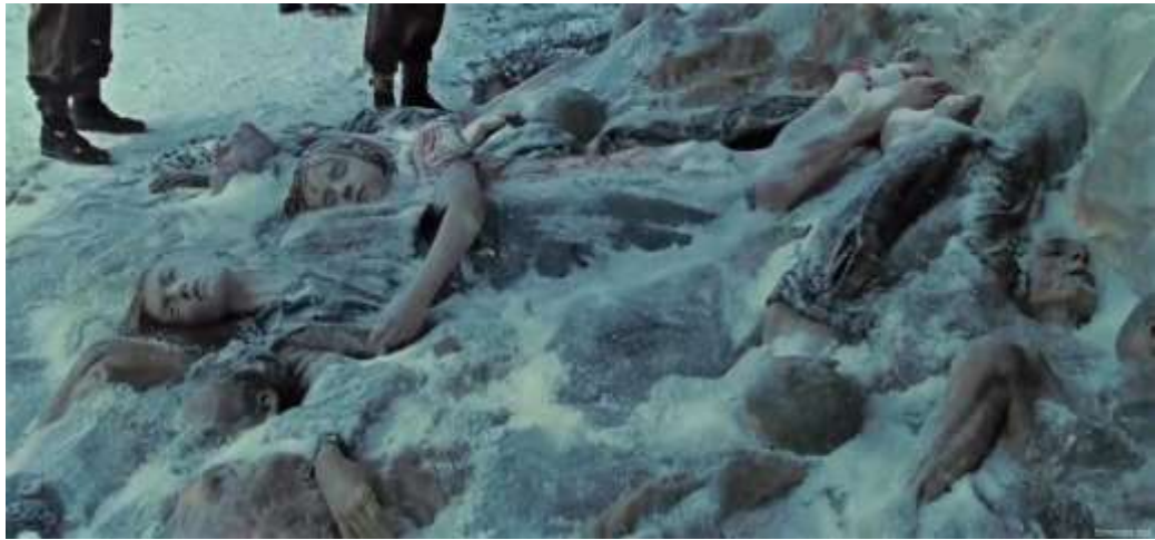
Figure 24: Dachau Concentration Camp (Scorsese, 2010, 43:18)

Flashbacks and reliving are in some ways worse than the trauma itself. Traumatic event has a beginning and an end-at some point it is over. But for people with PTSD a flashback can occur at any time, whether they are awake or asleep. (Van Der Kolk, 2014, p.67)