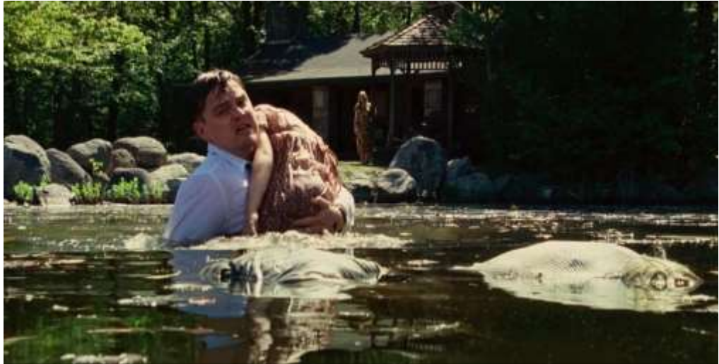
Figure 26: The Traumatic Lake House Scene (Scorsese, 2010, 02:00:41)

The extensive utilization of water symbolism in Shutter Island functions as a powerful metaphor, adding complexity and richness to the story. The presence of water in the movie symbolizes the hidden recesses of the mind, the profound realms enigmatic reality of psychological affliction and past trauma, in a similar vein, fire possesses to illuminate the most obscure recesses of the psyche. The uses of water and fire within Shutter Island serves as a powerful reminder of the multifaceted nature of the human existence, encouraging audiences to contemplate the nuances of identity, memory, and perception. As we explore into the depths of symbolism, we gain a profound insight into the inner struggles of the characters and the haunting elegance that accompanies their tumultuous voyage through the depths of the psyche.