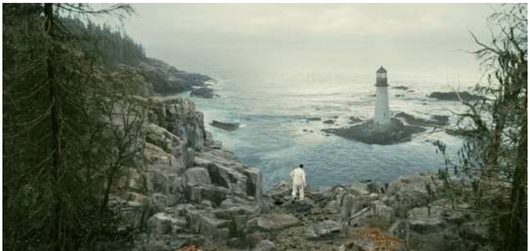
Figure 25: The Lighthouse and the Mystery of the Island (Scorsese, 2010, 01:42:58)

The lighthouse paves the path to the truth, the fact of putting its location surrounded by water acts like a barrier and forces Teddy to cross the sea in order to confront his other self-Andrew and his traumatic past, the lighthouse is the guidance for reality. Throughout the movie, everyone is leading Teddy to the lighthouse, but his fear from water is stopping him. At the end, he gets there in order to confront his conscious, the real Andrew Laeddis and to accept his true identity. Water in this particular scene embodies the truth and enlightenment to Teddy's journey. See figure 25.