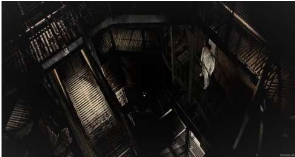
Figure 12: Ward C in Shutter Island (Scorsese,2010, 01:07:58)

conflict aims to create discomfort for audience and convey the feeling that something is wrong about the scene such as the design of Ward C, the bars and the corridor visually represent a sense of confinement and loss of freedom. See figure number 12.