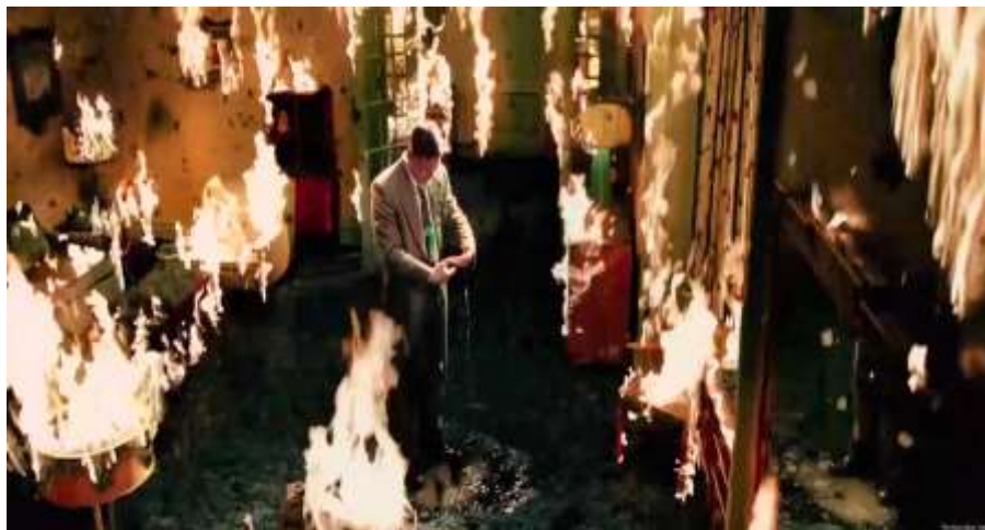
Figure 17: The Motif of Fire in Teddy's Hallucination (Scorsese, 2010, 30:15)

Moreover, Scorsese utilizes lighting that creates stark contrast between light and shadow, contributing eerie and surreal atmosphere. The flames heighten the sense of disorientation and unease, mirroring Teddy’s fractured state of mind. Cinematography techniques such as close-ups and distorted angles intensify the audience Teddy’s hallucination firsthand.