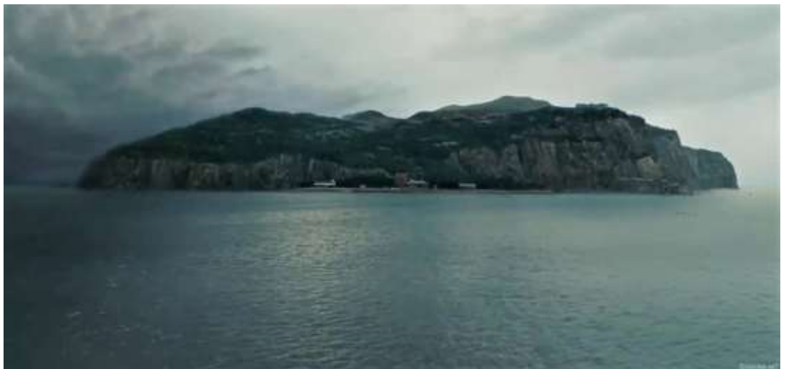
Figure 21: The isolated island surrounded by water (Scorsese, 2010, 03:48 )

To start with the choice of the setting, it was not by accident. At the opening scene in Shutter Island Scorsese adds smoke to the scene and gives a wide vision to the island to show how it is isolated from the outside world, a small island that is surrounded by water and a boat coming from the mist to state that the island separated from the outside world. The title itself is a symbolism of isolation and protection, the word "shutter" refers to the fact of blocking someone. The island blocks Teddy and protects him from knowing his actual truth that the world knows him being a murderer. See figure 21.