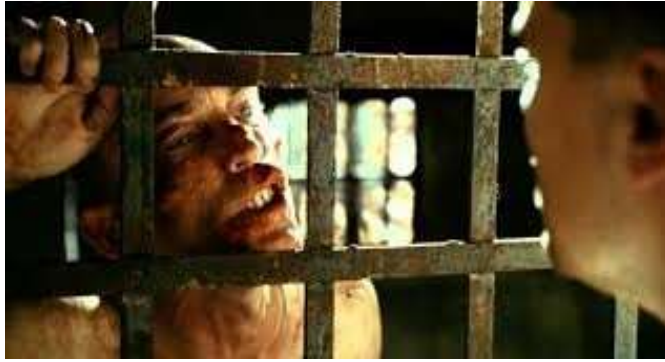
Figure 13: The meeting of Teddy and George Noyce in Ward C (Scorsese, 2010, 01:13:25)

Teddy makes his way to the lighthouse but he failed to reach there. He finds a woman hiding in cave, she says that she is the real Rachel Solando and explains that she was a former psychotropic at Aschecliffe and they are practicing illegal experiments on patients but the reality there is not any Rachel Solando. It is just a character created in Andrew's mind. He is confused and returns to the lighthouse. Here Dr. Cawley's goal is to push Teddy to confront his destination.