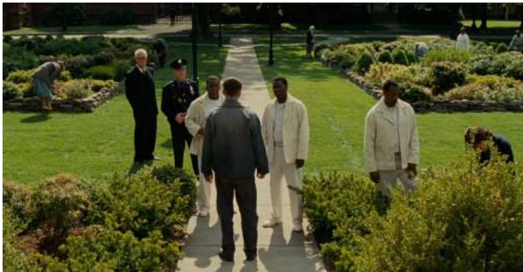
Figure 15: Andrew Preferring the Lobotomy over the New School of Treatment (Scorsese, 2010, 02:09:51)

He ends up accepting his identity for a while, but as it is shown in the figure 15 Scorsese chooses to put an ending to the story unlike Lehane's novel. Andrew tells Dr. Sheehan: "Which would be worse? To live as a monster, or to die as a good man?" (Scorsese, 2010) this line crucial because it questions whether Andrew is truly healed or healed or he is choosing to forget his past by preferring to undergo on a lobotomy than living in guilt we can understand that Andrew is a man of violence that does not accept reality. Through this scene, Scorsese shows that Andrew Laeddis does not believe in new European style of treatment, he is traumatized in many ways, because his decisions embody his old-fashioned character, a traditional who always prefers violence.