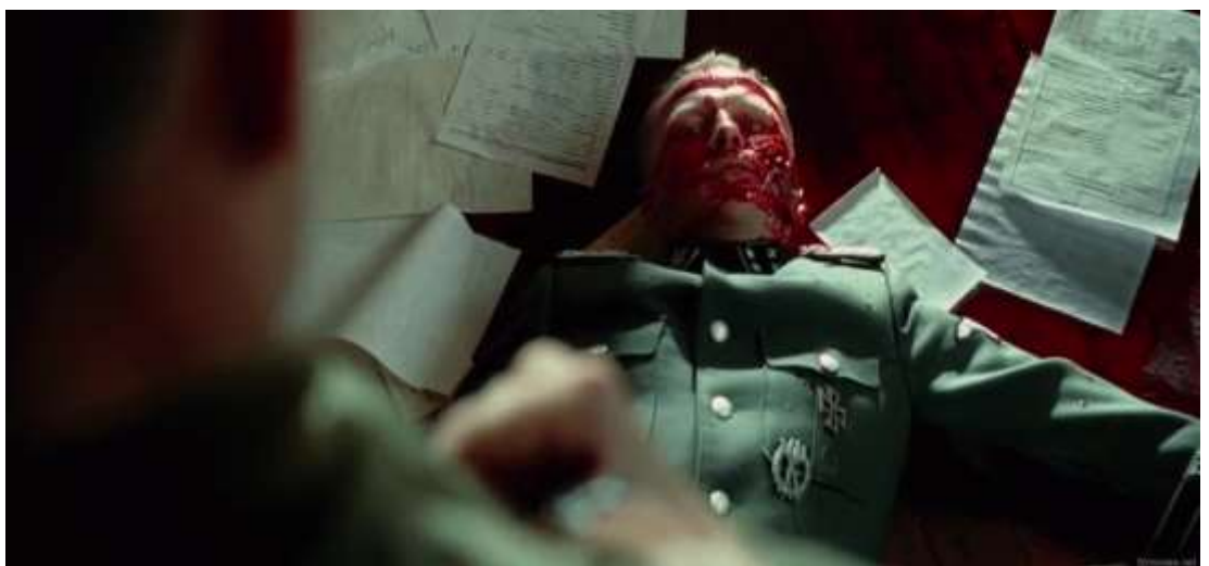
Figure 5: The Slow Death of the Commandant (Scorsese, 2010, 24:42)