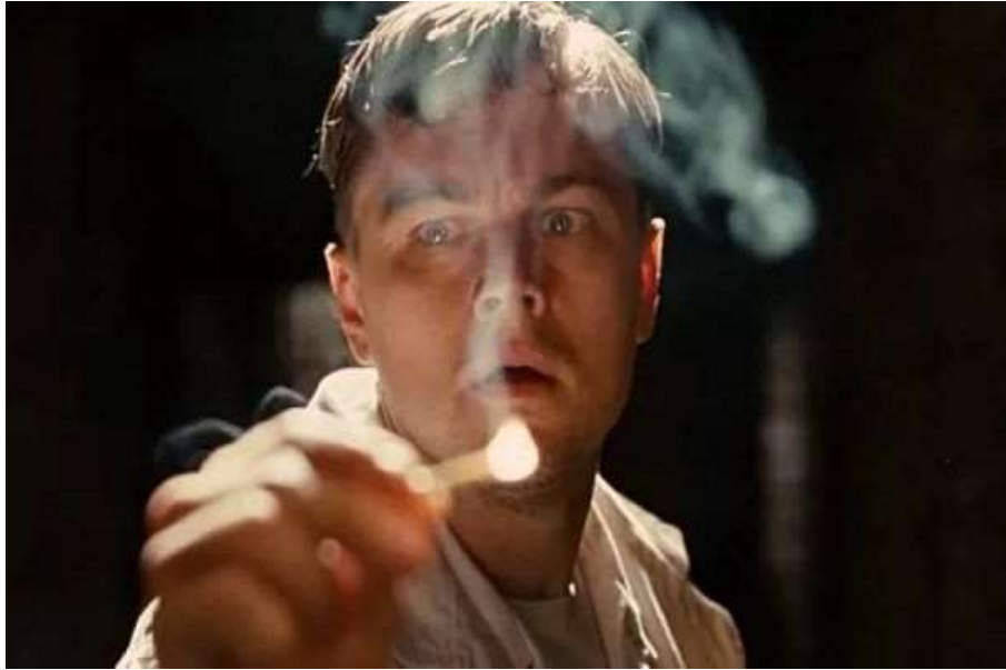
Figure 19: Ward C in Shutter Island and the Way to Reality (Scorsese, 2010, 01:10:26)

From the very beginning, Rachel exudes a sense of uncertainty and her appearance in the movie has a direct relation with fire, identity seems very complex for Teddy. As he goes deeper into the case of her vanishing, Rachel takes a role of an escaped patient. Throughout the movie, viewers, much like Teddy, are compelled to decipher the enigmatic person of Rachel Solando then a psychiatrist and the truth is that she is a part of Teddy's fantasy world. The recurring motif of fire plays a significant role in Rachel's narrative, carrying profound symbolic significance. Fire, as a symbol of hallucination and cleansing from guilt, serves as a potent of Andrew's internal conflict and emotional wounds. The tragic backstory of Rachel, which revolves around the heartbreaking loss of Andrew's children he created for himself a double identity clear from guilt by inventing anagrams for his wife Dolores channel and his daughter Rachel. Cinematically speaking how intelligently Scorsese incorporates fire in hallucination and nightmares and the way Rachel is presented with fire as a symbol of escapism is clever. The figure 20 is when Teddy finally meets the real Rachel Solando at the cave she tells him that the hospital is practicing surgeries in order to brainwash people. But actually the scene and the meeting with Rachel are made up by Teddy's mind. The flames in the cave serves as a symbol of insanity as an escapism.