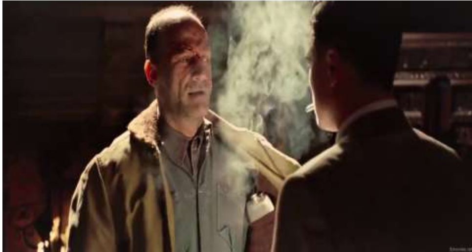
Figure 18: Confronting Inner Demons (Scorsese, 01:00:10)

The fire in Ward C represents the process of purging his mind from illusion at the same time agreeing with his inner demons. Within that Teddy's journey in the movie Scorsese focuses on shifting the character Teddy Daniels into his own identity Andrew Laeddis by giving visual clues and symbols, the viewer sees answers for that. Scorsese draws a visual hero to the story from his vast knowledge of cinema's history and employs genres conventions, color symbolism, and iconic imagery to create a visual arresting and stimulating narratives, seeing Teddy's violent side and the way Leonardo DiCaprio's performance captures the complex sense of Teddy's paranoia through his face expressions and body language. See figure 19. DiCaprio immerses viewers in Teddy's psychological journey and make them question reality. Teddy moves down his path, caring a lit sparkler to illuminate parts of the scene. The fire symbolizes lighting up his way to the lighthouse to lead him toward sanity.