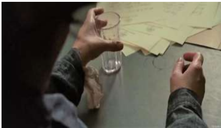
Figure 23: The empty Glass (Scorsese, 2010, 37:29)

Furthermore, the use of water emerges also in Teddy's dreams and hallucination, blending water and fire at the same scene is also a symbol of truths and lies. The fact of seeing Dolores in much of the scene all wet even though Teddy believes that she died at a fire accident symbolizes the reality of drowning he children. Water emerges also when Teddy accuses a memory of the concentration camp in Dachau, seeing the dead people all frozen and sometimes wet means that these events may be real. See figure 24. The stormy weather in the island is a metaphor to Teddy's mind. The entire story happened during a violent storm to state Teddy's anger and pain. In other words, the storm represents the chaos in his feeling of guilt that he carries after surviving from his traumatic past events. As Bessel Van der Kolk suggests in his book "The Body Keeps the Score" that the memories of traumatic events are dangerous than the trauma itself, because the repetition of the events in life is disturbing or even life threatening. This highlights how teddy is stuck in his past unable to escape the cycle of reliving his painful memories: