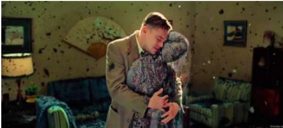
Figure 16: Teddy's Wife Burning (Scorsese, 2010, 30:05)