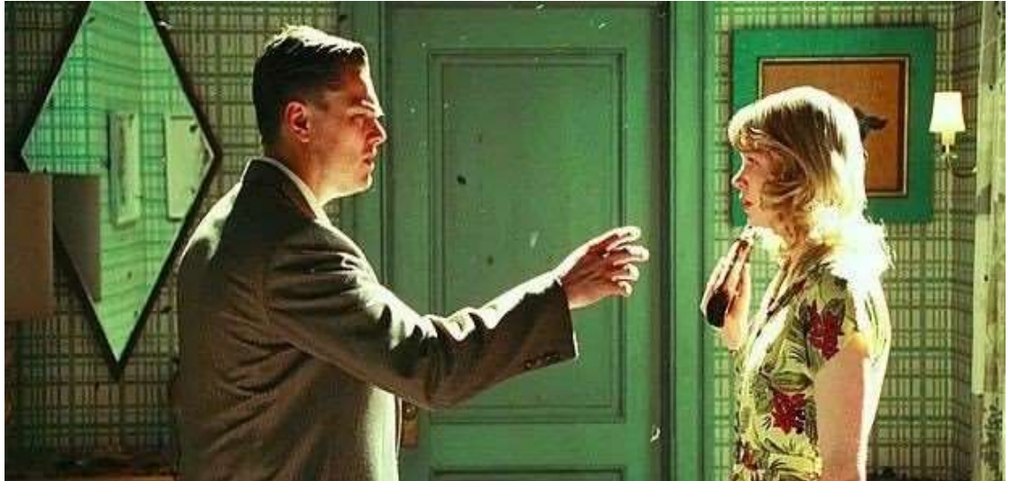
Figure 6: Teddy's Dream of Dolores (Scorsese, 2010, 27:58)

In the sixth figure, teddy sees his wife Dolores in his dream. He tells her that he killed a lot of people in the war. He asks her if she is real and he wanted to touch her. This explains the feeling of guilt that Teddy carries toward his wife because he neglects her sickness. He doesn't want to let her go. Then she starts burning in his hands and disappears. (Scorsese, 2010, 30:05). At the end of the fire we discover that he killed her wife because she drowned their children. Teddy has an amnesic behavior syndrome which is a defense of mechanism rooted in denial and repression instead of accepting that he killed his wife after she drowned their children he constructs another reality in which his wife died in an apartment building.